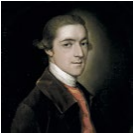
John Spencer, created Earl Spencer