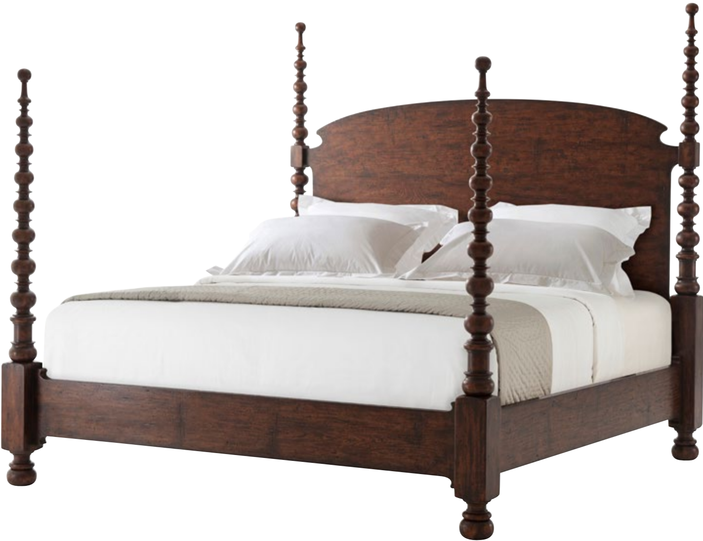
NASEBY US KING BED AL83022

A reclaimed oak veneered and mahogany tester King bed, with an arched headboard and four turned columns on a paneled foot rail, on turned legs. 85¼ x 88½ x 80½ in | 216.53 x 224.8 x 204.47 cm