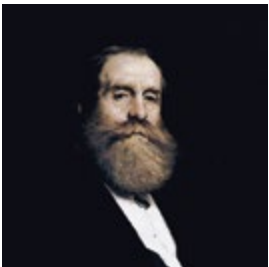
John Poyntz, 5th Earl Spencer