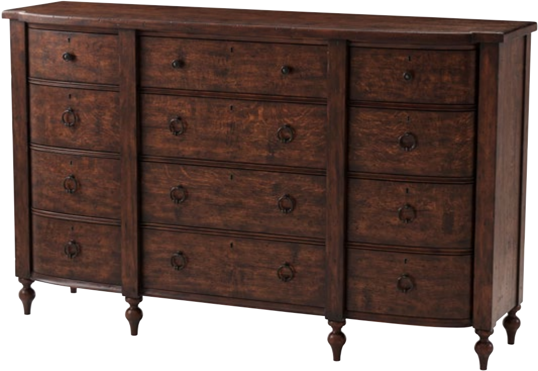
NASEBY DRESSER AL60047

A reclaimed oak and mahogany veneered nighthstand with Bellied Drawer Faces, shaped top, and with four finely turned legs. Designed with Oil rubbed Escuthcheons, and pull drawers. 34 x 20 x 32 in | 86.36 x 50.8 x 81.3 cm