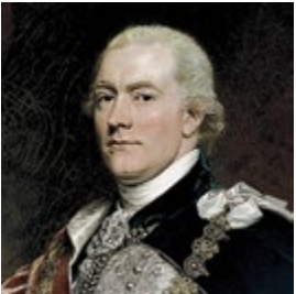
George John, 2nd Earl Spencer