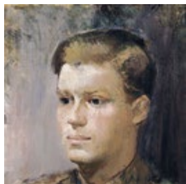
Edward John, 8th Earl Spencer