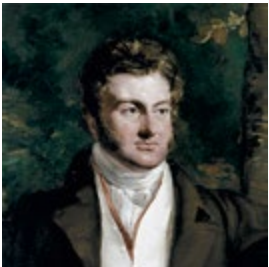
John Charles, 3rd Earl Spencer