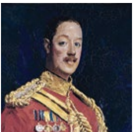
Albert Edward John, 7th Earl Spencer