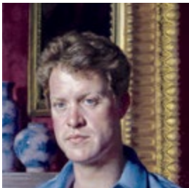
Charles Edward Maurice, 9th Earl Spencer