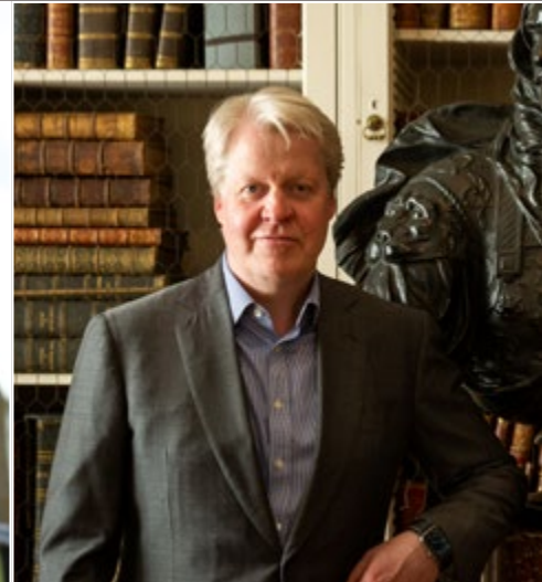
THE 9 TH EARL SPENCER