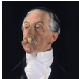
Charles Robert, 6th Earl Spencer