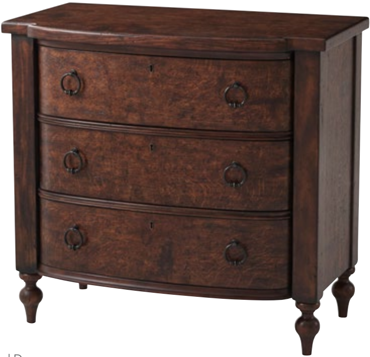
NASEBY NIGHTSTAND AL60046

A reclaimed oak veneered and mahogany tester King bed, with an arched headboard and four turned columns on a paneled foot rail, on turned legs. 85¼ x 88½ x 80½ in | 216.53 x 224.8 x 204.47 cm