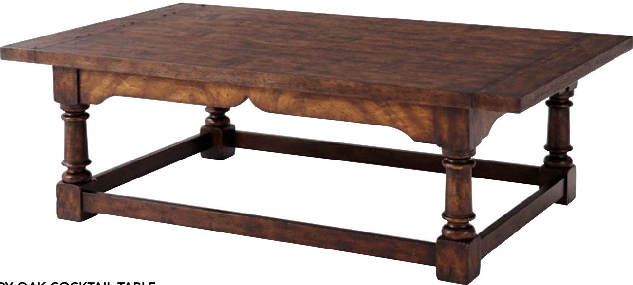
VICTORY OAK COCKTAIL TABLE AL51041

30 x 20 x 26 in | 76.2 x 50.8 x 66.04 cm