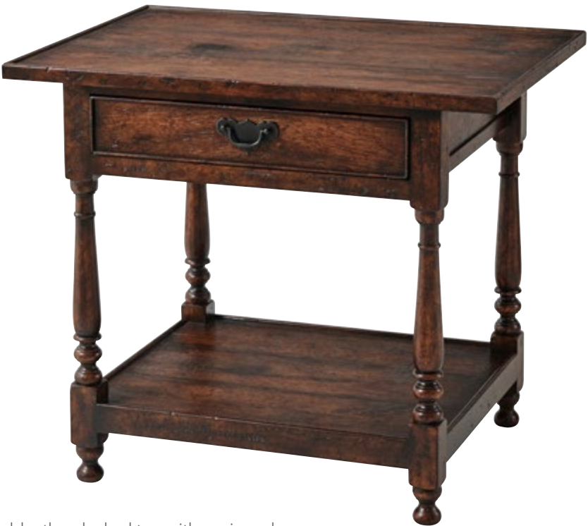
BUTLER'S SIDE TABLE AL50159

A reclaimed oak veneered and mahogany accent table, the planked top with a raise edge, above a frieze drawer and baluster turned legs joined by an undertier, on bun feet.