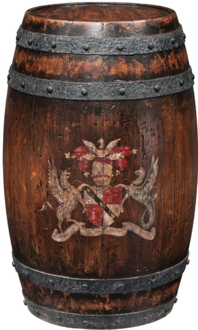
TALBOT BARREL ACCENT TABLE AL50127

An antiqued wooden barrel, the circular top above planked sides bound by hand-forged iron riveted straps and hand painted with the Spencer coat of arms.