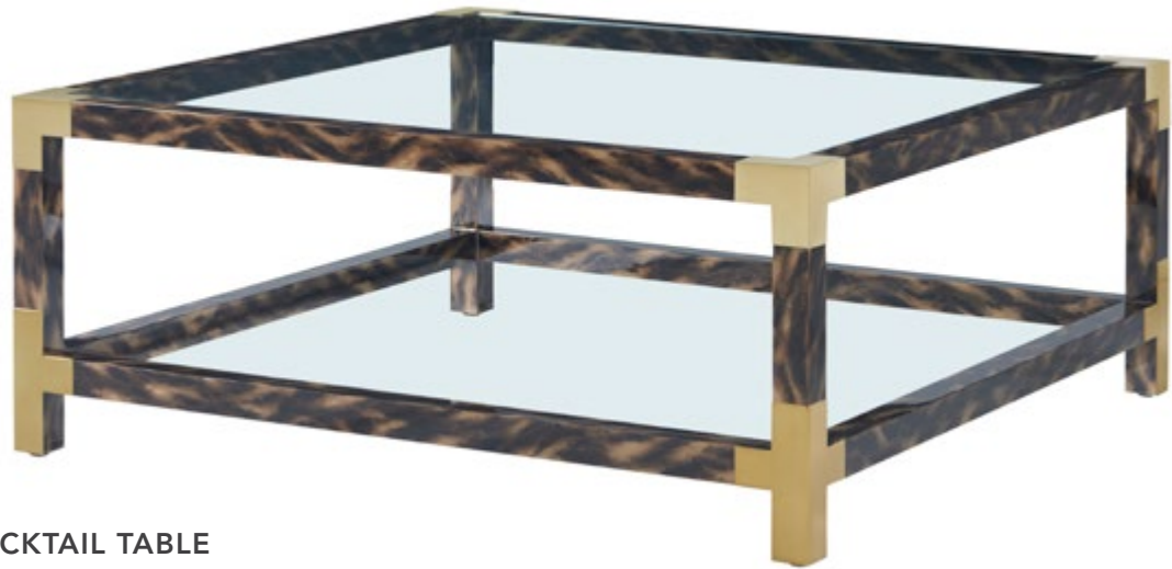
ARAKAN SQUARE COCKTAIL TABLE TA51296 With a low geometric frame crafted from chic tortoiseshell-lacquered faux-horn, the Arakan Square Cocktail Table features a square tempered glass inset top and lower shelf with brass-tone stainless steel edged corners. Stretchers between legs extend the natural warmth of the piece, offering strength and stability without sacrificing design. 44 x 44 x 18 in | 111.8 x 111.8 x 45.7 cm