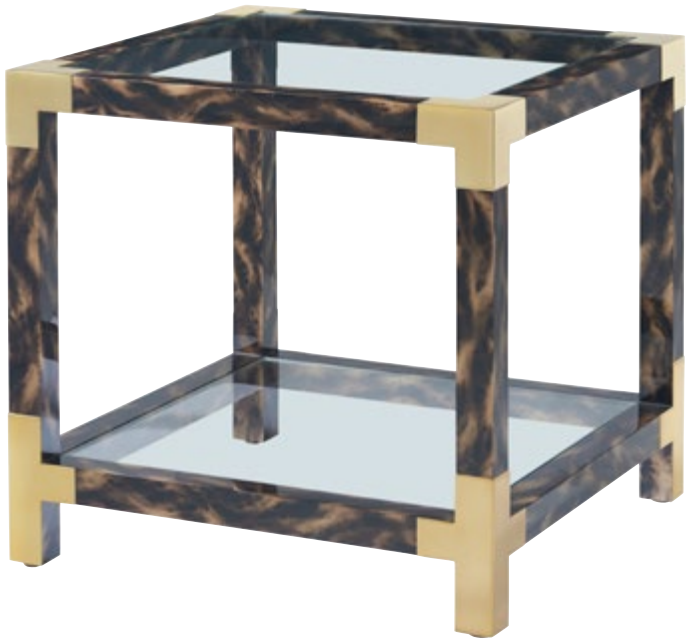
ARAKAN SIDE TABLE TA50427 With a geometric frame crafted from chic tortoiseshell-lacquered faux-horn, the Arakan Side Table features a square tempered glass inset top and lower shelf with brass-tone stainless steel edged corners. Stretchers between legs extend the natural warmth of the piece, offering strength and stability without sacrificing design. 25 x 25 x 24 in | 63.5 x 63.5 x 61 cm