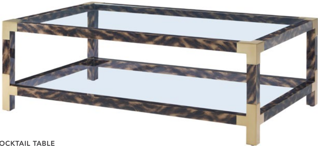
ARAKAN COCKTAIL TABLE TA51297 With a low rectangular frame crafted from chic tortoiseshell-lacquered faux-horn, the Arakan Cocktail Table features a rectangular tempered glass inset top and lower shelf with brass-tone stainless steel edged corners. Stretchers between legs extend the natural warmth of the piece, offering strength and stability without sacrificing design. 54 x 34 x 18 in | 137.1 x 86.4 x 45.7 cm