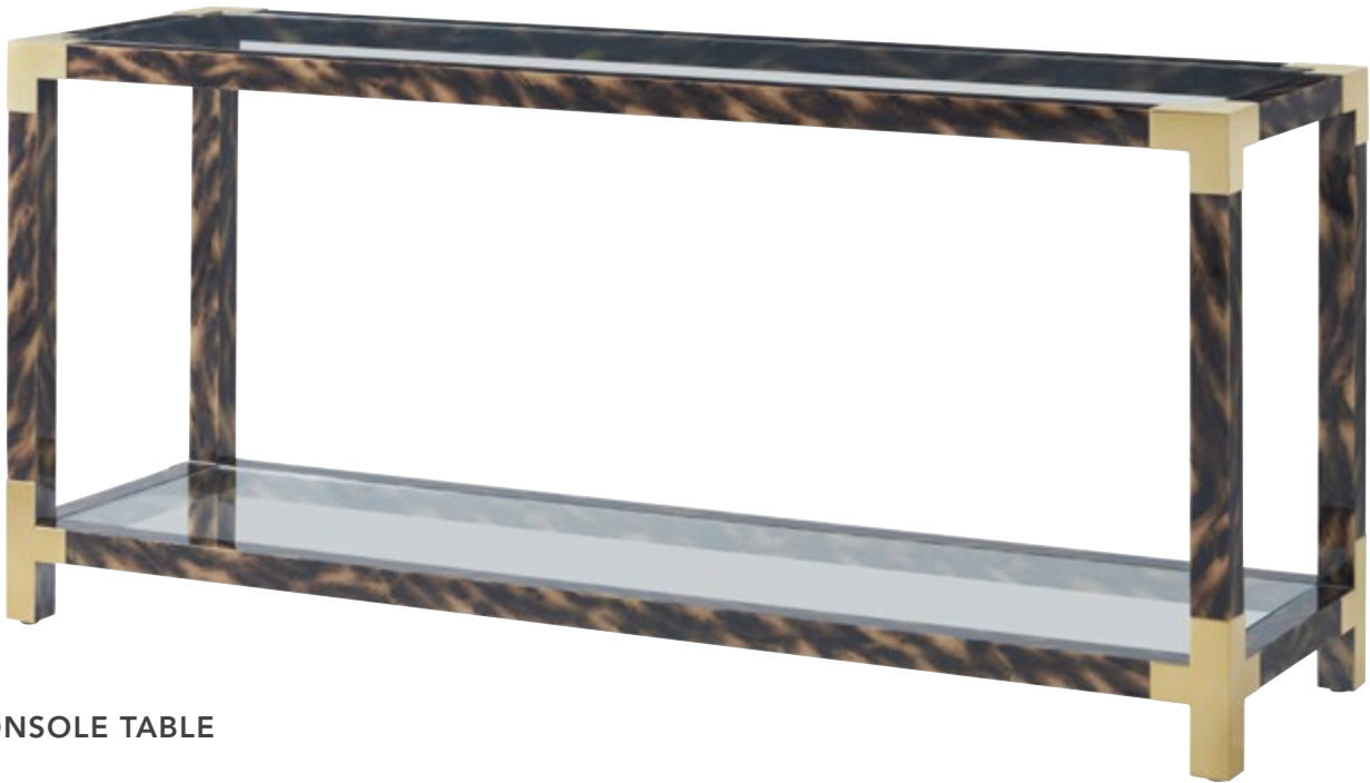
ARAKAN CONSOLE TABLE TA53155 With a rectangular frame crafted from chic tortoiseshell-lacquered faux-horn, the Arakan Console Table features a rectangular tempered glass inset top and lower shelf with brass-tone stainless steel edged corners. Stretchers between legs extend the natural warmth of the piece, offering strength and stability without sacrificing design. 65 x 18 x 30 in | 165.1 x 45.7 x 76.2 cm