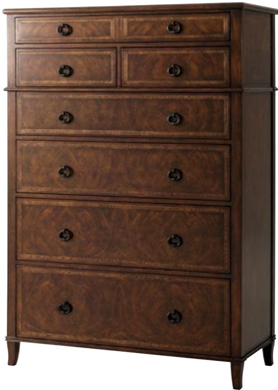
VALET'S COMPANION CHEST 6005-505

60 x 19 x 36 in | 152.5 x 48.3 x 91.5 cm