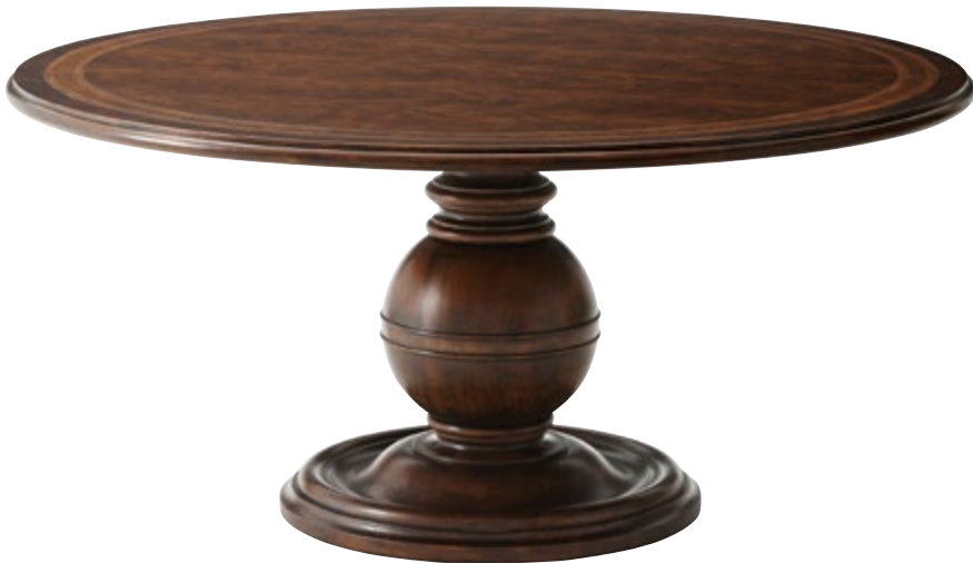
DIDEROT DINING TABLE 5405-262

Upholsered in Linen-UP5409 Fabric Trim: Welting