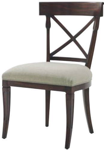
BROOKSBY SIDE CHAIR 4000-830.1BFD

A side chair, the curved bar top rail above an 'X' back and upholstered seat, on carved sabre legs. The original French Provincial, circa 1820.