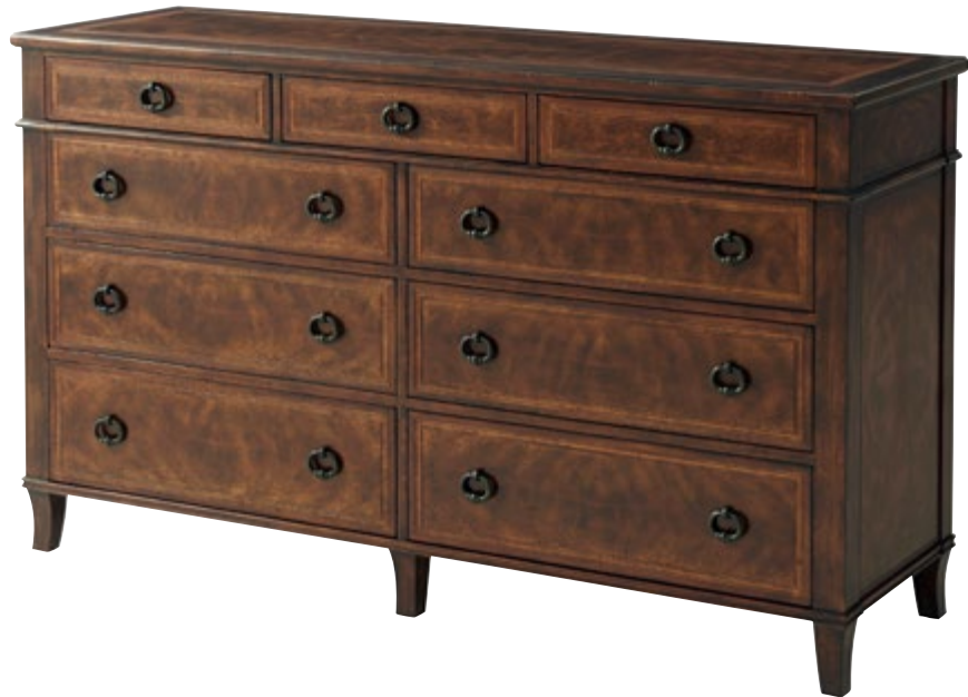
BROOKSBY DRESSER 6005-491

A cerejeira veneered and mahogany dresser, the rectangular crossbanded top above three short frieze drawers and six further long graduated drawers, on splayed legs. Inspired by a 20 th century Italian original.