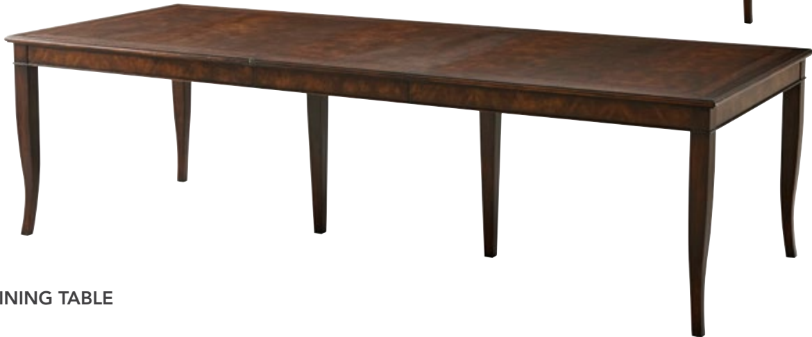
VILLA OLMO DINING TABLE 5405-259

A cerejeira veneered and mahogany extending dining table, the crossbanded rectangular top opening to accommodate one additional leaf, the veneered frieze above square tapering and splayed legs. Inspired by a 19th century French original.