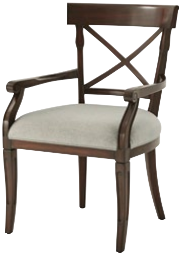
BROOKSBY ARMCHAIR 4100-830.1BFD

Upholsered in Linen-UP5409 Fabric Trim: Welting