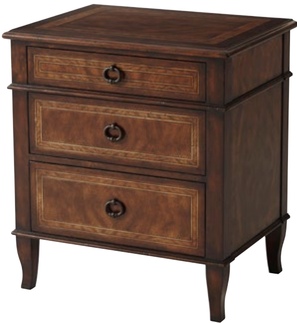
BROOKSBY NIGHTSTAND 6005-504

83½ x 86¾ x 61½ in | 212.1 x 220.4 x 156.14 cm