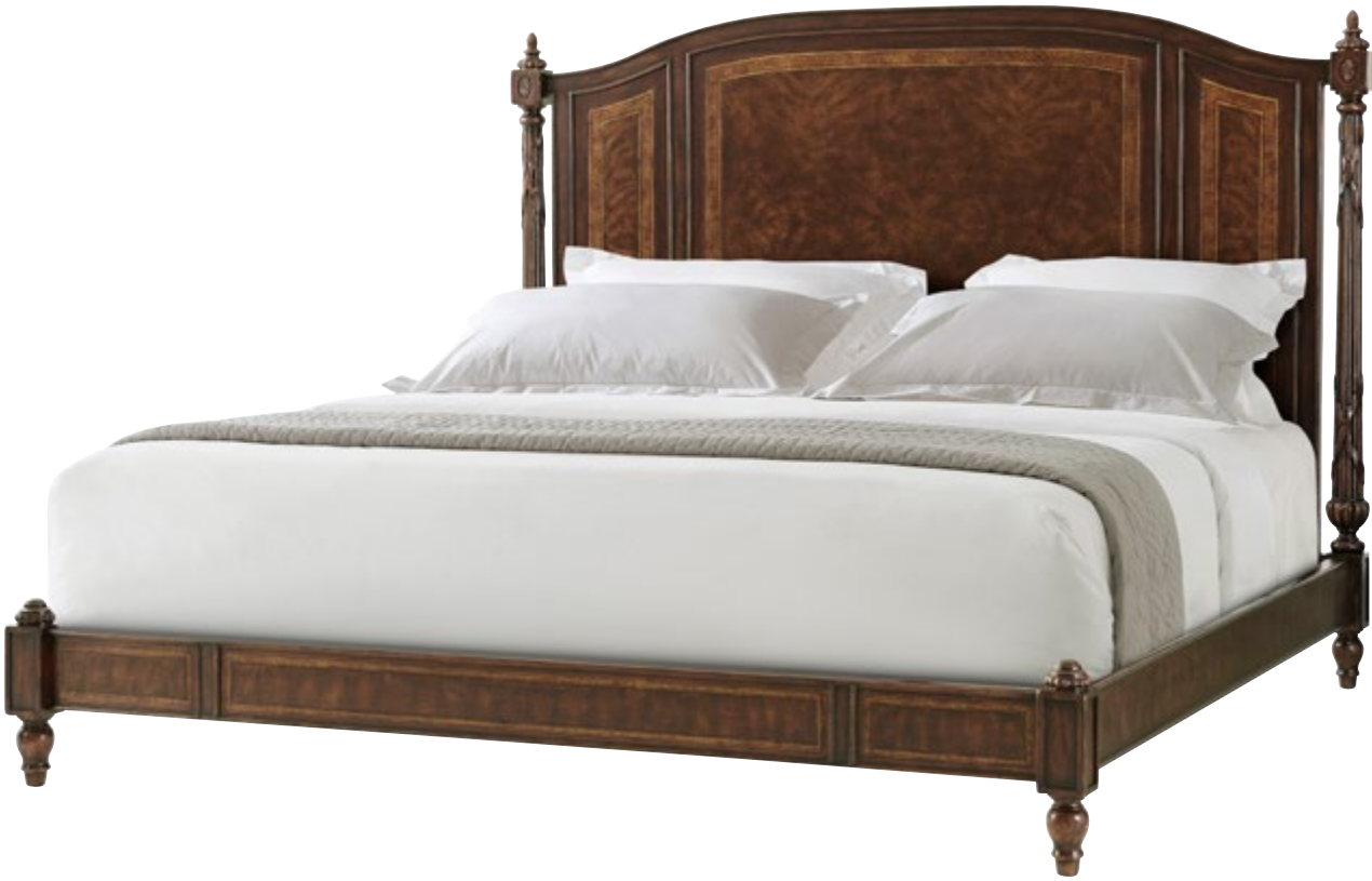
BROOKSBY US KING BED 8305-062

67½ x 86¾ x 61½ in | 171.5 x 220.5 x 156.14 cm