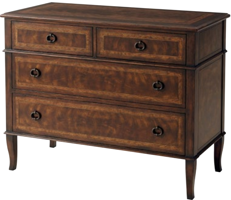
BROOKSBY CHEST 6005-490

A cerejeira veneered and mahogany chest of drawers, the rectangular crossbanded top above two short frieze drawers and two further long graduated drawers, on splayed legs.