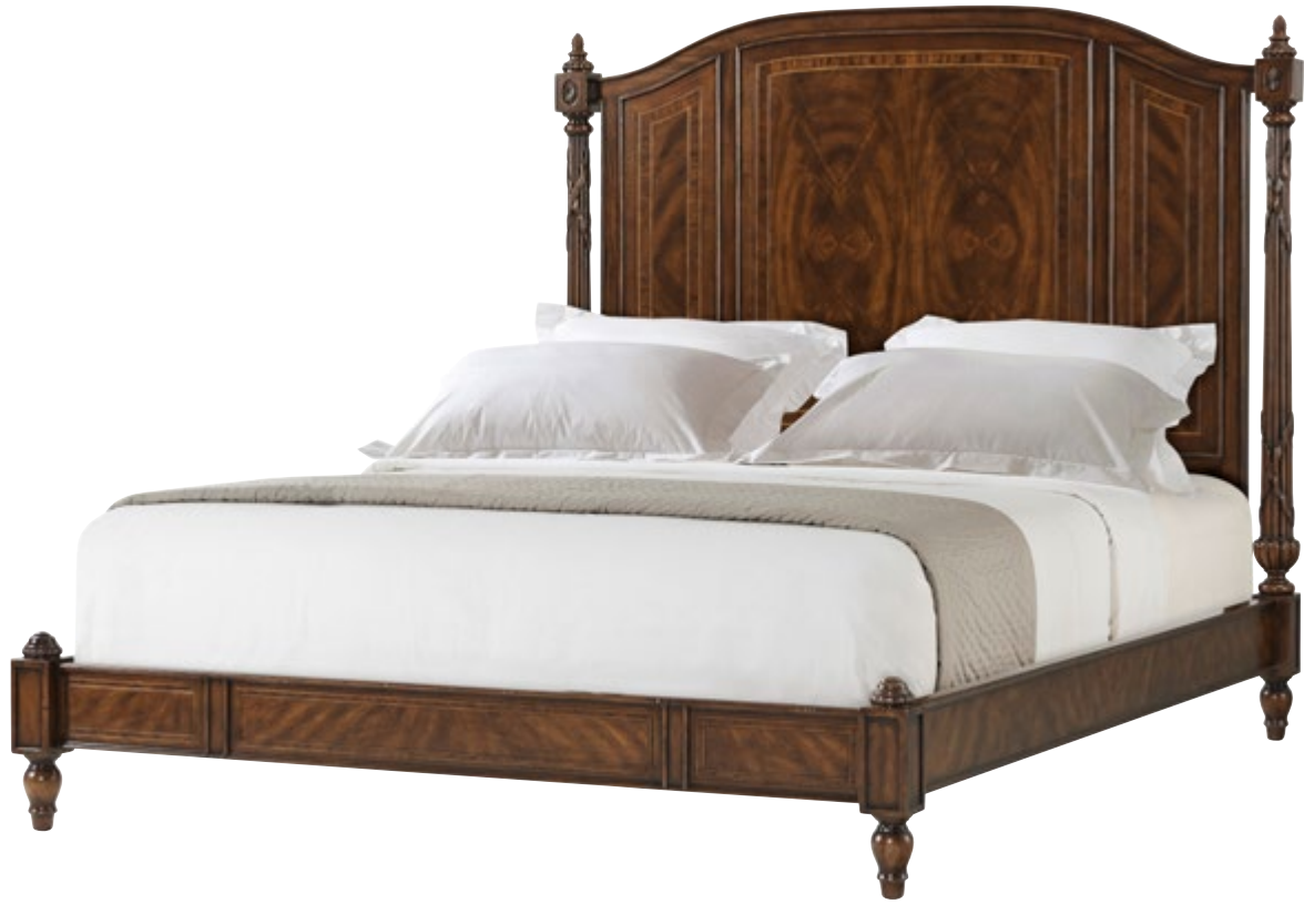
BROOKSBY US QUEEN BED 8205-062

A cerejeira veneered and crossbanded Queen Bed, the arched headboard of three crossbanded panels flanked by bound reeded carved columns, with a panelled low footboard, on turned tapering legs. Inspired by a 19th century French original.