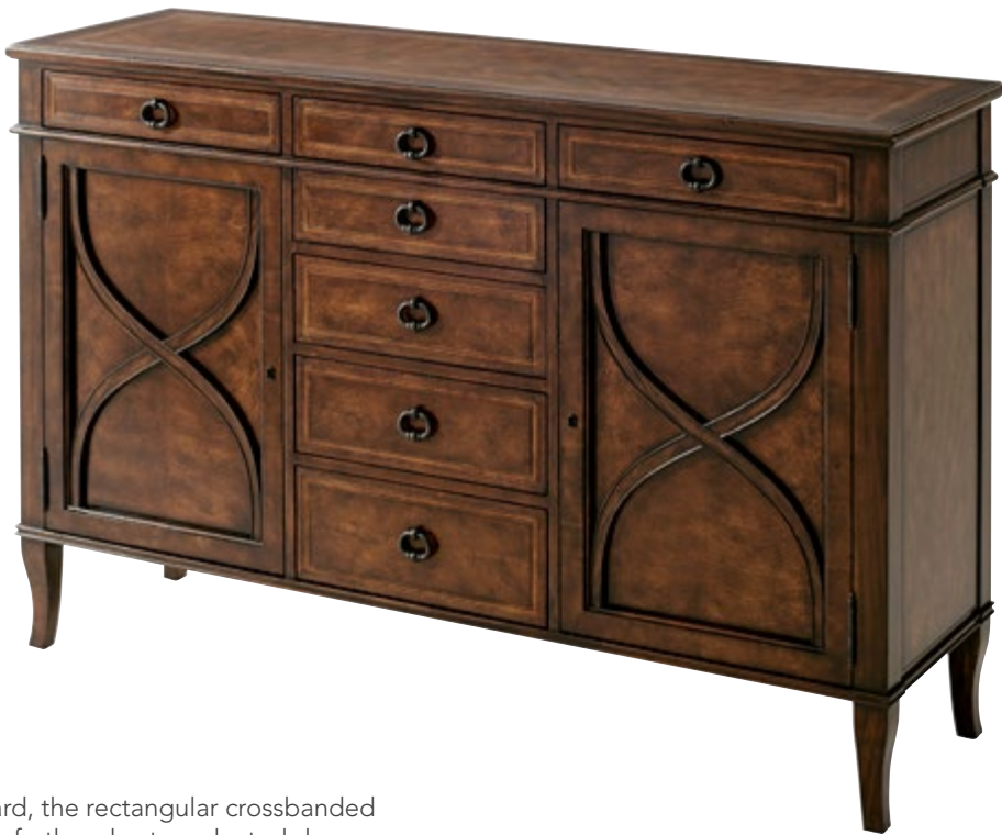
VILLA OLMO BUFFET 6105-472

Open: 108 x 44 x 30 in | 274.30 x 111.80 x 76.20 cm Closed: 84 x 44 x 30 in | 213.36 x 111.80 x 76.20 cm