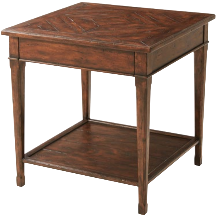
THE CASTLE GUEST SIDE TABLE CB50001 An antiqued wood bedside or lamp table, with a frieze drawer and the square tapering legs joined by an undertier. The original French Provincial. 26 x 26 x 27 in | 66.04 x 66.04 x 68.58 cm