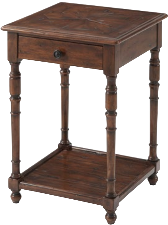
IDA'S SIDE TABLE CB50023 An antiqued wood side table, with a frieze drawer, on turned legs joined by a planked undertier. The original 17th century. 18 x 18 x 26 in | 45.72 x 45.72 x 66.04 cm

An antiqued wood lamp table, the square parquetry top above a drawer and bell turned legs joined by a serpentine 'X' stretcher. The original William and Mary. 26 x 26 x 26-½ in | 66.04 x 66.04 x 67.31 cm