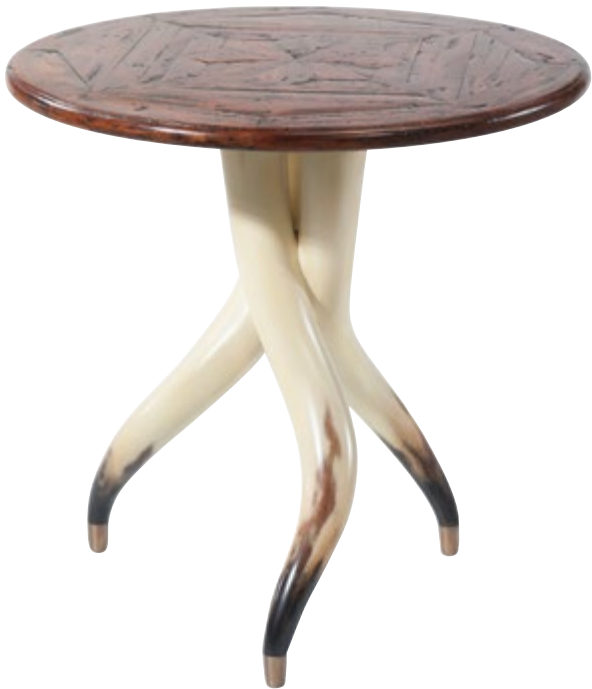
THE LONGHORN SIDE TABLE CB50012

An antiqued wood parquetry top lamp table, on a triple intertwined faux steer horn base with brass cappings. The original Victorian. 26 x 26 x 26 in | 66.04 x 66.04 x 66.04 cm