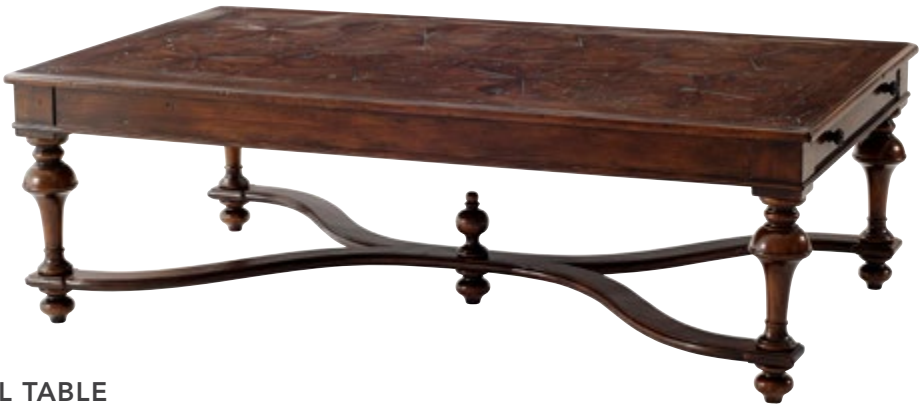
THE RUSTIC PARQUETRY COCKTAIL TABLE CB51003

An antiqued wood cocktail table, with parquetry inlay, the rectangular top with two end drawers, on bell turned legs joined by an ‘X’ stretcher. The original William and Mary. 63 x 35-¾ x 20 in | 160.02 x 90.81 x 50.8 cm