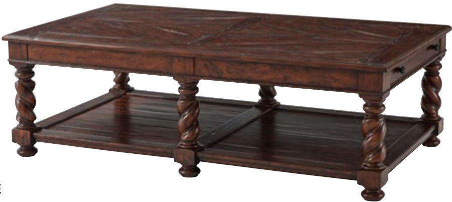
THE GREAT HALL COCKTAIL TABLE CB51001

An antiqued wood cocktail table with two end drawers, on spiral turned legs joined by an solid panelled undertier. The original 17th century. 63 x 36 x 20-½ in | 160.02 x 91.44 x 52.07 cm