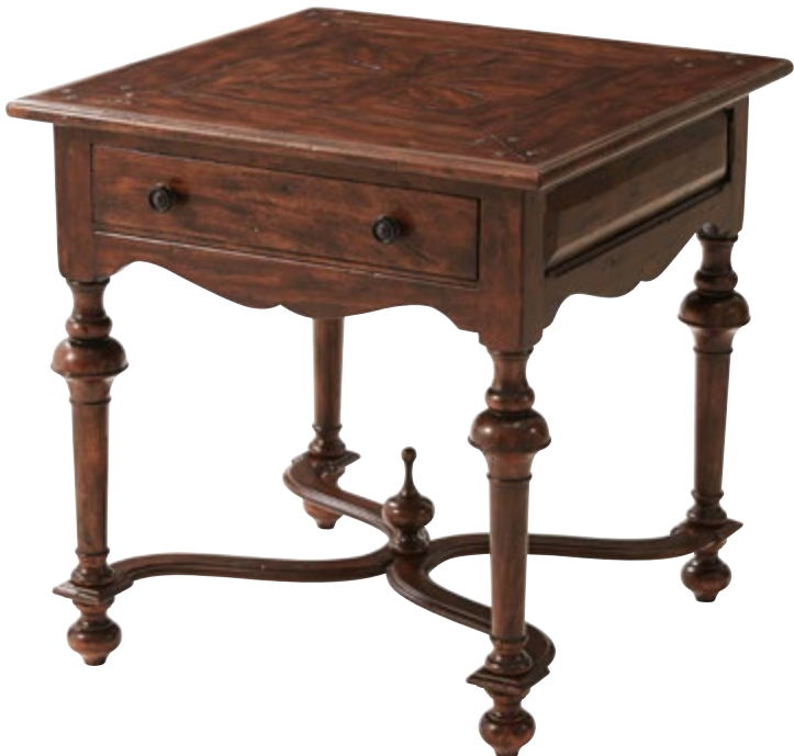
HEIRLOOM FROM THE HALL SIDE TABLE CB50013

An antiqued wood parquetry top lamp table, on a triple intertwined faux steer horn base with brass cappings. The original Victorian. 26 x 26 x 26 in | 66.04 x 66.04 x 66.04 cm