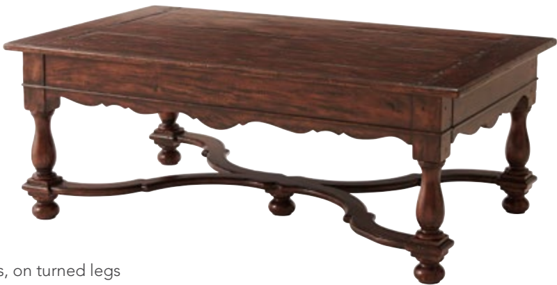
THE ANTIQUED COCKTAIL TABLE CB51002

An antiqued wood cocktail table, with two end drawers, on turned legs joined by an “X” stretcher. The original William and Mary. 54-½ x 32 x 20-½ in | 138.43 x 81.28 x 52.07 cm