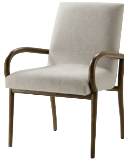
CATALINA DINING ARM CHAIR II TA41012.1CGO 24 x 25¾ x 35 in | 61 x 65.3 x 89 cm Shown in Earth Finish; UP6167 Fabric Available in Dune Finish: TA41012.1CIS