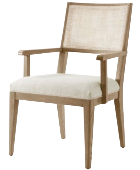
CATALINA DINING ARM CHAIR TA41016.1CGN 24 x 25½ x 36 in | 61 x 64.7 x 91.4 cm Shown in Dune Finish; UP6169 Fabric Available in Earth Finish: TA41016.1CIR