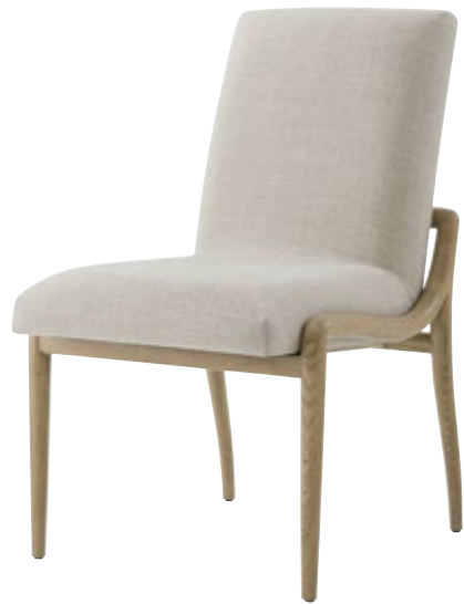
CATALINA DINING SIDE CHAIR II TA40012.1CIS 22 x 26¼ x 35½ in | 55.9 x 66.5 x 90.2 cm Shown in Dune Finish; UP6167 Fabric Available in Earth Finish: TA40012.1CGO