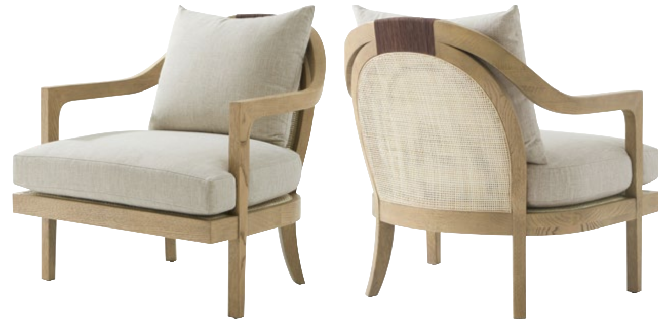
CATALINA ACCENT CHAIR TA42008.1CGP 32 x 32 x 34 in | 81.3 x 81.3 x 86.4 cm Shown in Dune Finish; UP6169 Fabric