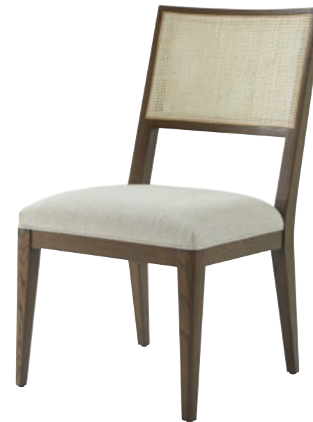
CATALINA DINING SIDE CHAIR TA40016.1CIR 20 x 25½ x 36 in | 50.8 x 64.7 x 91.4 cm Shown in Earth Finish; UP6169 fabric Available in Dune Finish: TA40016.1CGN