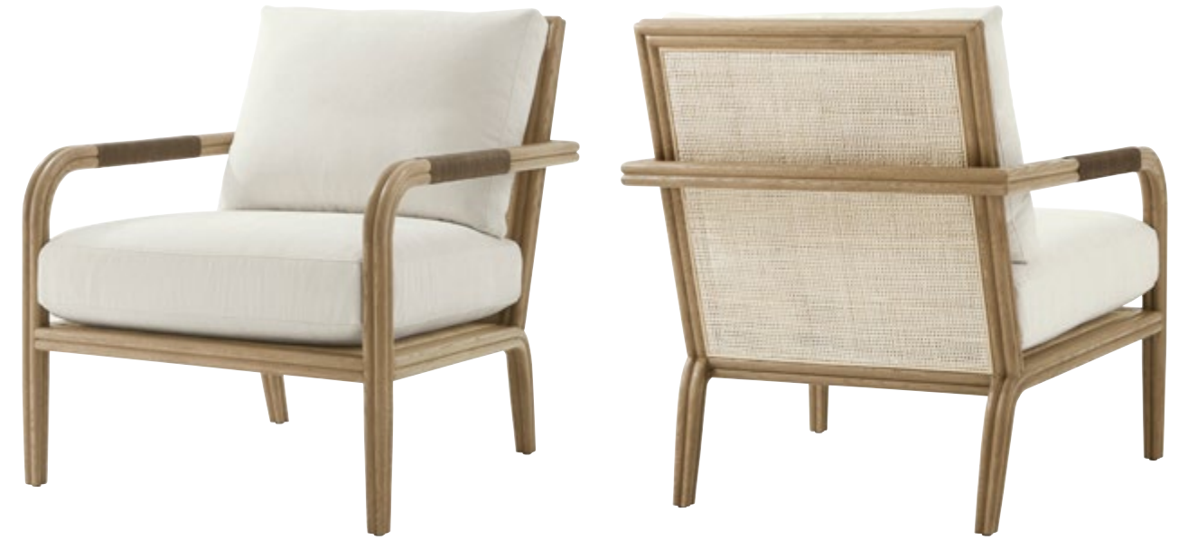
CATALINA ACCENT CHAIR III TA42011.1CGR 30 x 34½ x 33½ in | 76.2 x 87.4 x 85.1 cm Shown in Dune Finish; UP6170 Fabric