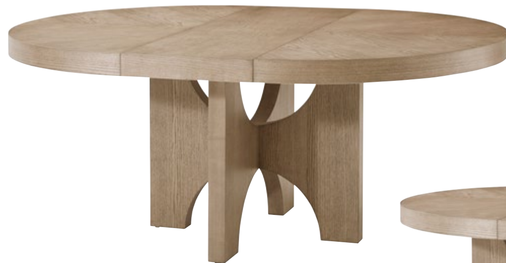
CATALINA EXTENDING ROUND DINING TABLE TA54026.C306 Open: 72 x 54 x 30 in | 182.9 x 137.2 x 76.2 cm Closed: 54 x 54 x 30 in | 137.2 x 137.2 x 76.2 cm Shown in Dune Finish Available in Earth Finish: TA54026.C301