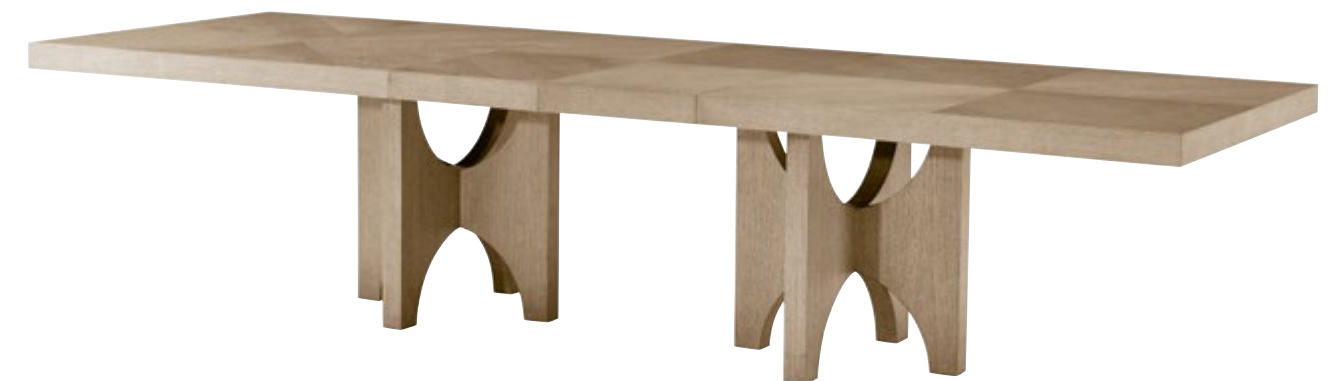
CATALINA EXTENDING DINING TABLE TA54024.C306 Open: 133 x 44 x 30 in | 337.9 x 111.7 x 76.2 cm Closed: 97 x 44 x 30 in | 246.5 x 111.7 x 76.2 cm Shown in Dune Finish Available in Earth Finish: TA54024.C301