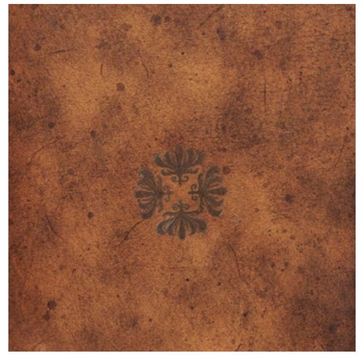
BUFFALO BROWN - DISTRESSED Suffix Code: BD