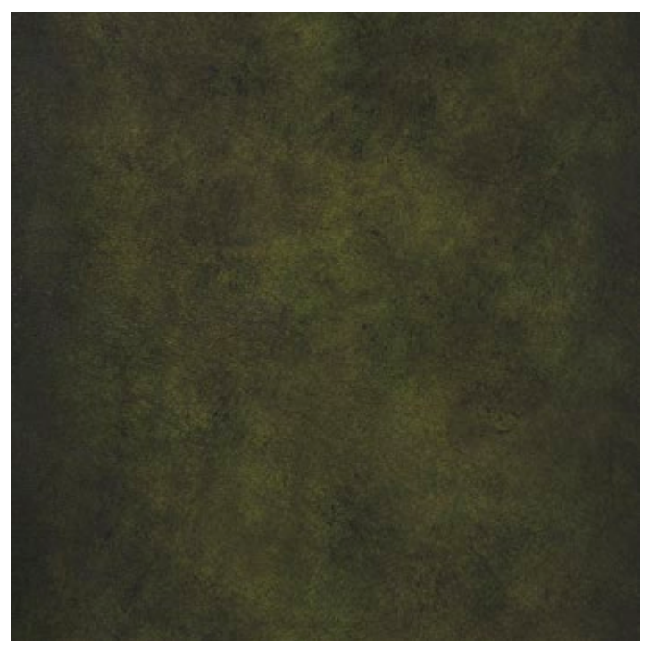
ASHDOWN GREEN Suffix Code: AN