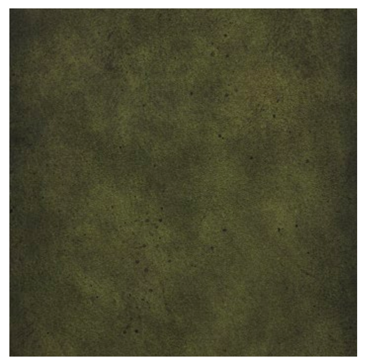
ASHDOWN GREEN - DISTRESSED Suffix Code: AD