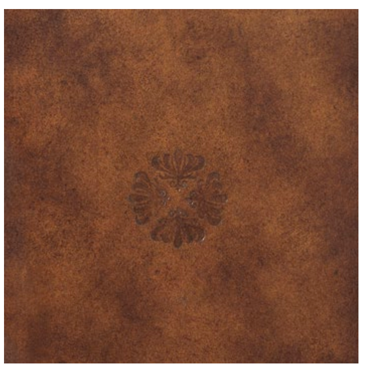
BUFFALO BROWN Suffix Code: BN