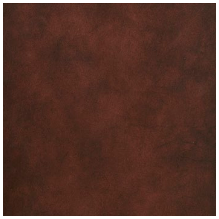
OXBLOOD RED Suffix Code: ON