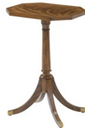
SLOANE OCCASIONAL TABLE II-SC50048

Hand Formed with luxurious cerejeira crotch and morado woods. Finished in Edwardian Brown.