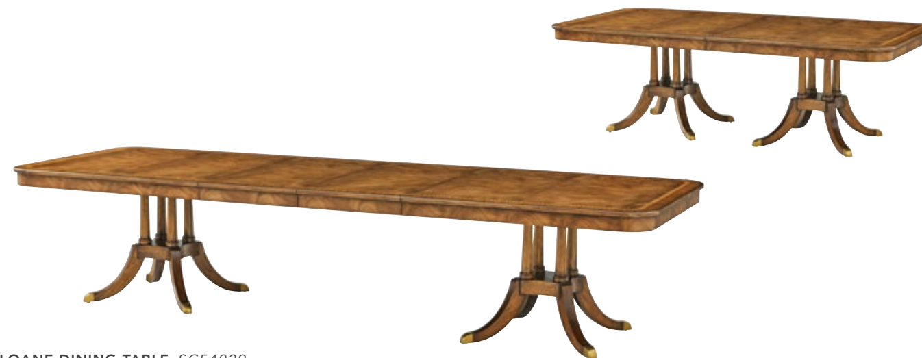
SLOANE DINING TABLE—SC54029

Upholstered in UP7280 fabric; Trim: Welting.