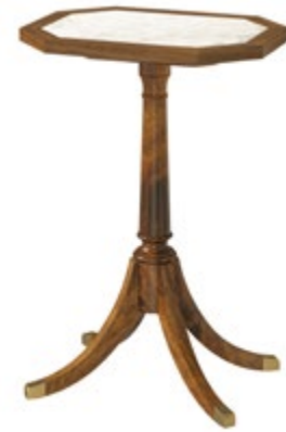
SLOANE OCCASIONAL TABLE-SC50043

Hand Formed with luxurious Khaya and walnut woods. Finished in Edwardian Brown.