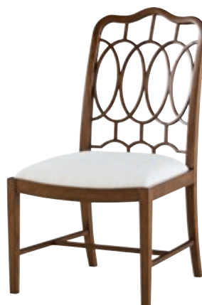
SLOANE SIDE CHAIR II—SC40012.1DJU

Handcrafted from Khaya swirl and Khaya wood. Finished in Edwardian Brown.