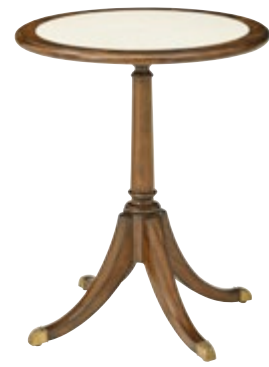
SLOANE ROUND OCCASIONAL TABLE-SC50042