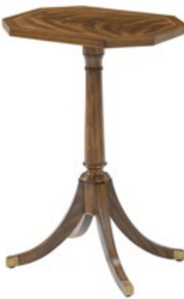
SLOANE OCCASIONAL TABLE II–SC50048

The Sloane Round Occasional Table II is a luxurious, mixed material design. At the top, a canted cerejeira crotch surface is complemented by a beautiful morado inlay. Hand Formed with luxurious cerejeira crotch and morado woods. Finished in Edwardian Brown.