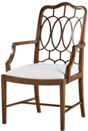
SLOANE ARMCHAIR II —SC41012.1DJU

The Sloane Side Chair II is a beautiful transition piece. Along the back, a light, rounded motif conveys an understated richness, while slender, sabre legs add a refined elegance. Handcrafted from Khaya swirl and Khaya wood. Finished in Edwardian Brown. Upholstered in UP7280 fabric; Trim: Welting.