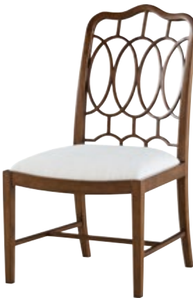
SLOANE SIDE CHAIR II —SC40012.1DJU

Characterized by a refined aesthetic, the Sloane Dining Table features curved corners, saber legs, and a magnificent Khaya swirl surface. Handcrafted from Khaya swirl and Khaya wood. Finished in Edwardian Brown.