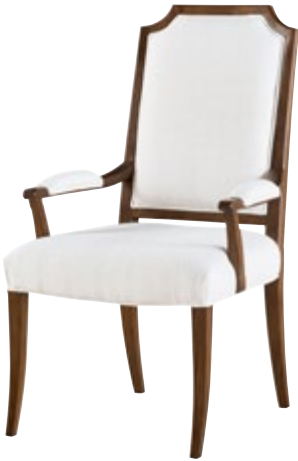
SLOANE ARMCHAIR —SC41011.1DJS

The Sloane Side Chair is a beautiful homage to English influence in 19 th century design. Sumptuous upholstery across the backs and arms add a sense of refinement, while slender, saber legs compose the delicate form of the base. Handcrafted from Khaya swirl and Khaya wood. Finished in Edwardian Brown. Upholstered in UP7280 fabric; Trim: Welting.