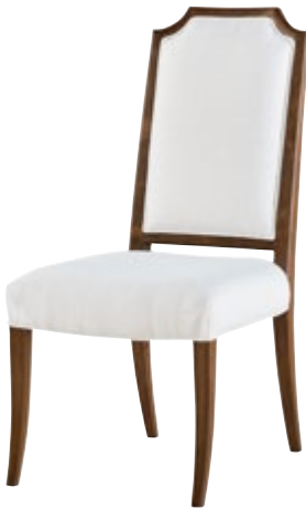
SLOANE SIDE CHAIR —SC40011.1DJS

W 20 D 26½ H 42 in W 50.8 D 67.3 H 106.7 cm