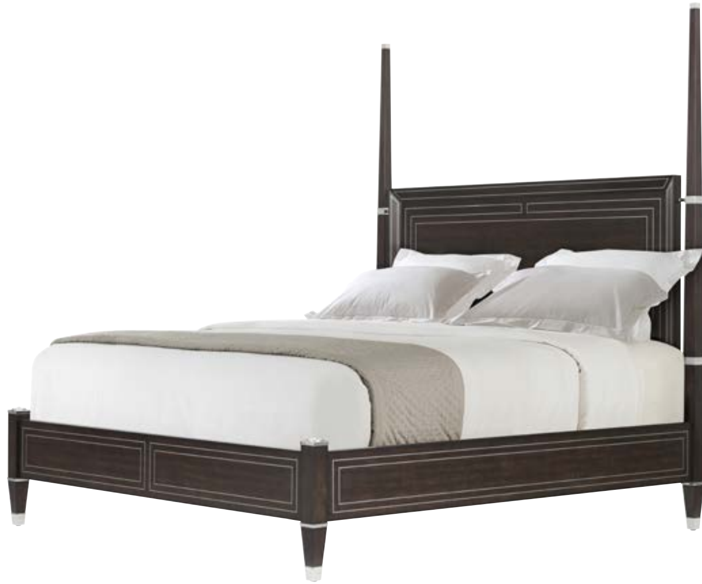
SPENCER LONDON KING POSTER BED TA83090.C399 82 x 86¼ x 89 in | 208.2 x 218.9 x 226.1 cm As shown in Fulham finish Also available in Chelsea finish: TA83090.C400