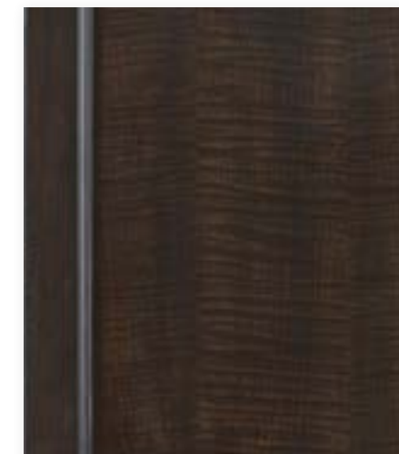
FULHAM ON FIGURED SYCAMORE (C399)