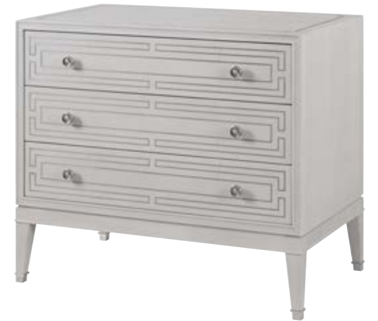
SPENCER LONDON 3-DRAWER NIGHTSTAND TA60165.C400 32¼ x 20¼ x 28 in | 81.8 x 51.4 x 71.1 cm As shown in Chelsea finish Also available in Fulham finish: TA60165.C399