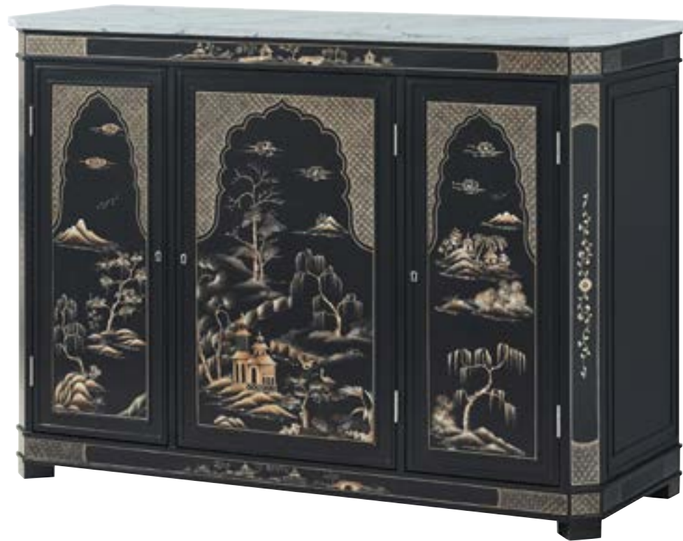
SPENCER LONDON CHINOISERIE CHEST TA61233 56 x 20 x 40 in | 142.2 x 50.8 x 101.6 cm