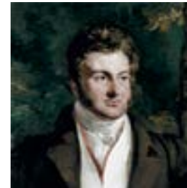
John Charles, 3rd Earl Spencer