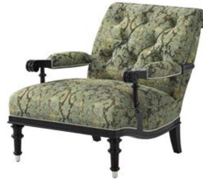
LAMBETH CHAIR SL3194

Shown in 6230-93 Fabric Shown in Carlisle Black Finish