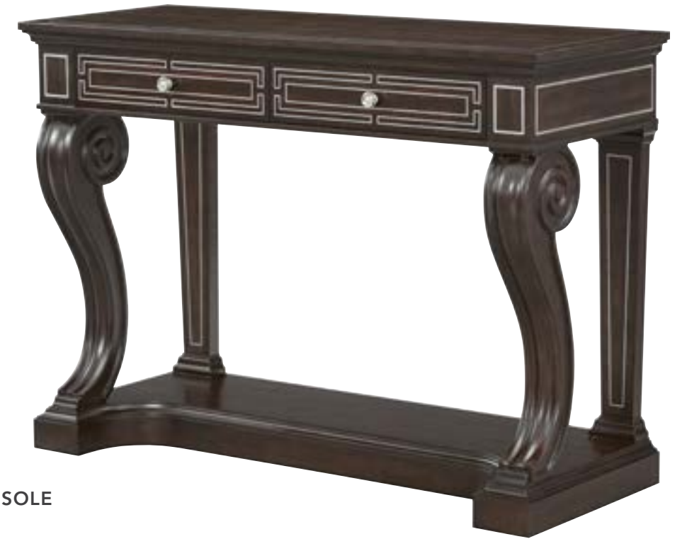
SPENCER LONDON EMPIRE CONSOLE TA53140.C399 52 x 20 x 37 in | 132.1 x 50.8 x 94 cm As shown in Fulham finish Also available in Chelsea finish: TA53140.C400