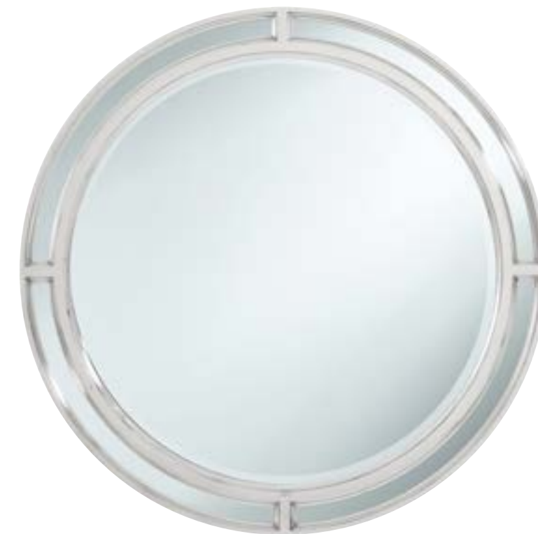
SPENCER LONDON ROUND MIRROR TA31017

As shown in Fulham finish Also available in Chelsea finish: TA31020.C400