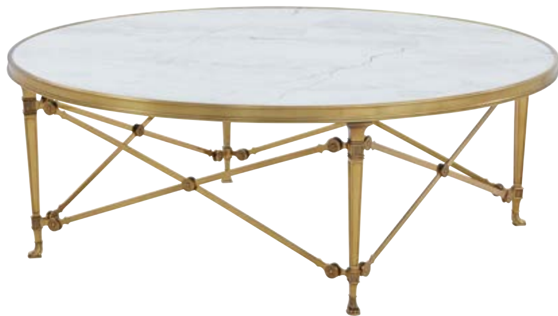
SPENCER LONDON BRASS COCKTAIL TABLE TA51268 45 x 45 x 16 in | 114.3 x 114.3 x 40.6 cm