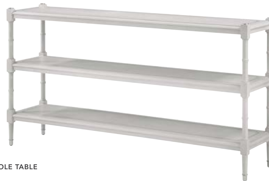
SPENCER LONDON CONSOLE TABLE TA53111.C400 60 x 14 x 32 in | 152.4 x 35.6 x 81.3 cm As shown in Chelsea finish Also available in Fulham finish: TA53111.C399