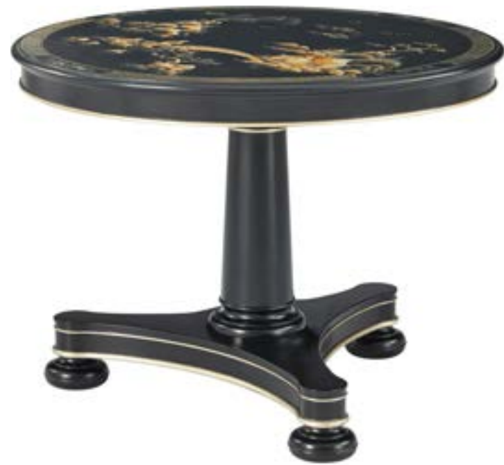
SPENCER LONDON CHINOISERIE CENTER TABLE TA55009 42 x 42 x 30 in | 106.7 x 106.7 x 76.2 cm