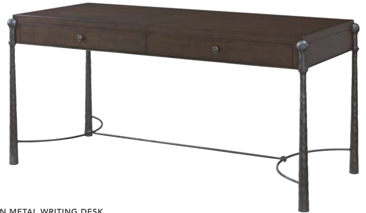
SPENCER LONDON METAL WRITING DESK TA71061.C399 66 x 30 x 31 in | 167.6 x 76.2 x 78.7 cm As shown in Fulham finish