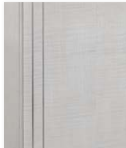
CHELSEA ON FIGURED SYCAMORE (C400)