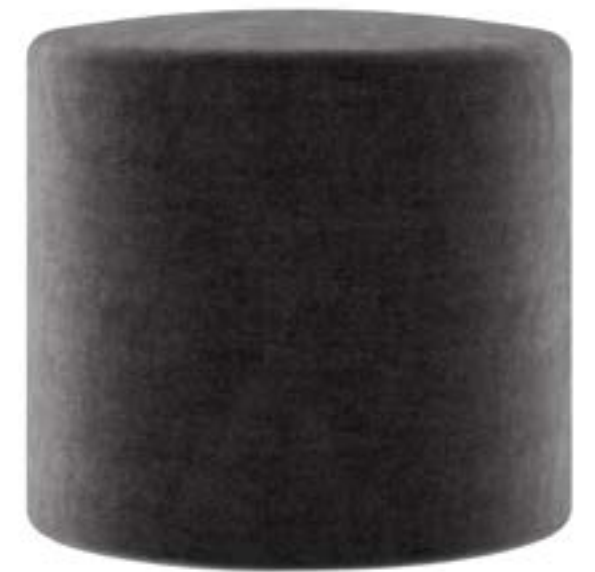
DAGENHAM STOOL SL8197

22 x 22 x 21.5 in | 55.88 x 55.88 x 54.6 cm As shown in 9009-94 fabric