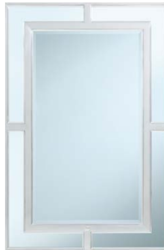
SPENCER LONDON RECTANGLE MIRROR TA31016