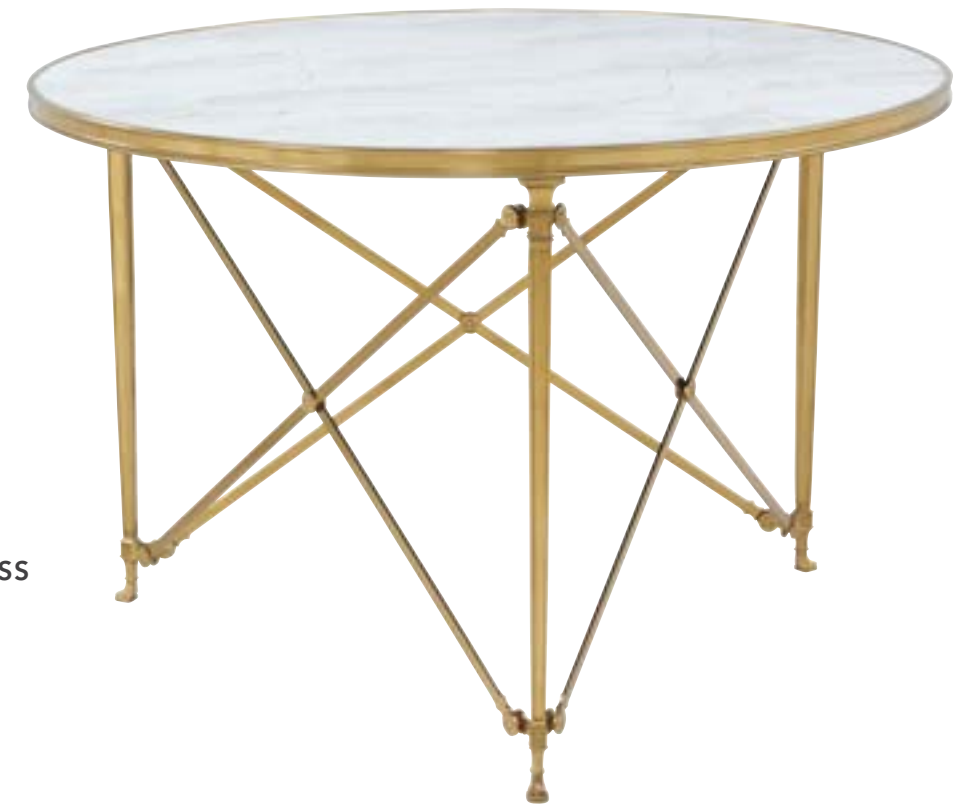
SPENCER LONDON ROUND BRASS CENTER TABLE II TA55011 45 x 45 x 29½ in | 114.3 x 114.3 x 74.9 cm As shown in Cannes Brass