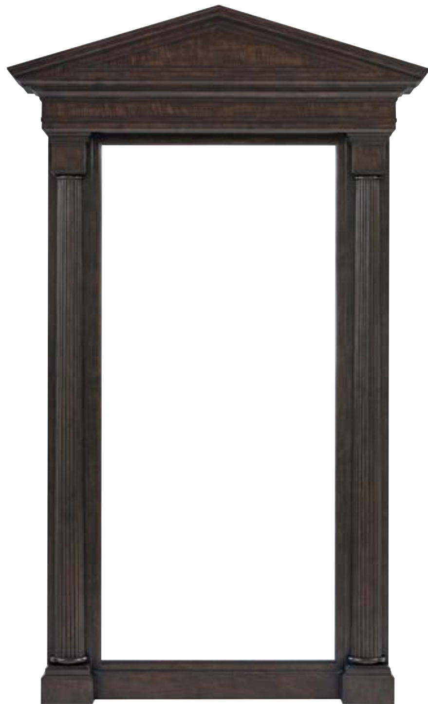
SPENCER LONDON FLOOR MIRROR TA31020.C399

55½ x 7¾ x 92 in | 141 x 19.4 x 233.7 cm