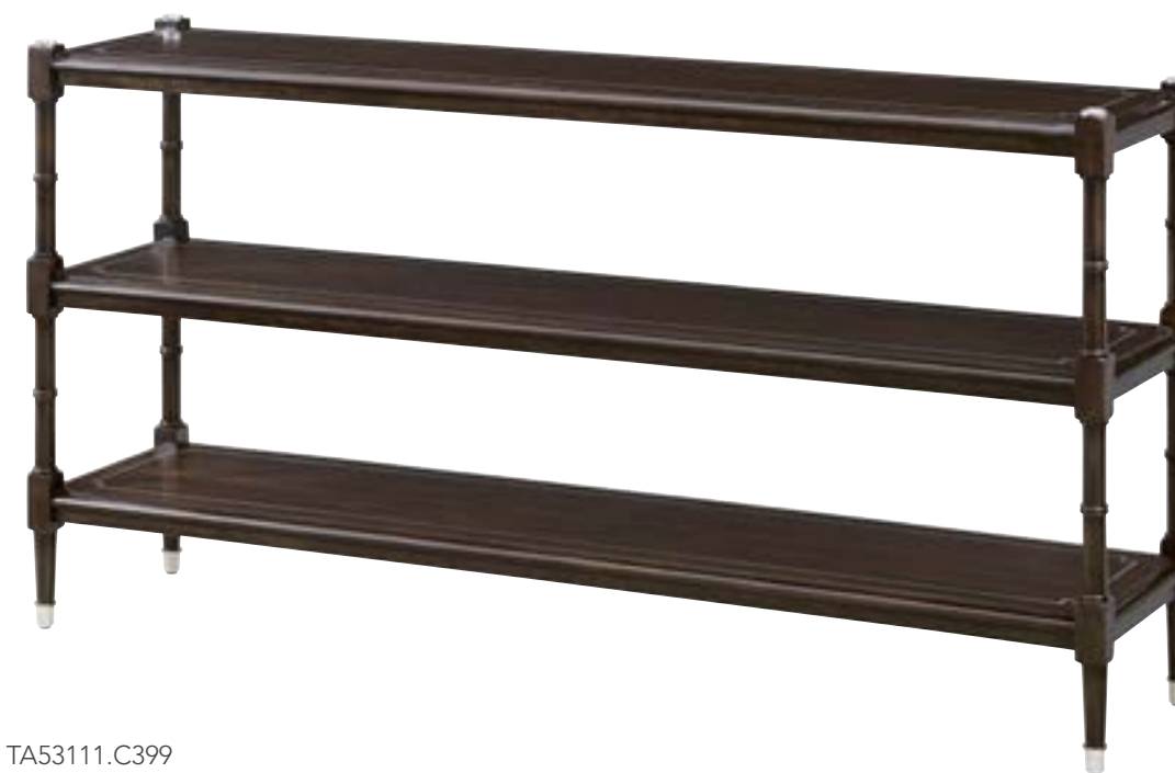
Also available in Fulham finish: TA53111.C399