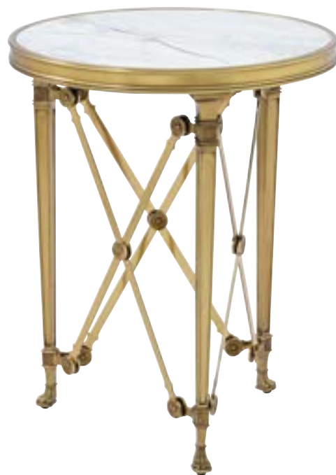
SPENCER LONDON ROUND BRASS SIDE TABLE TA50398 18 x 18 x 22 in | 45.7 x 45.7 x 55.9 cm