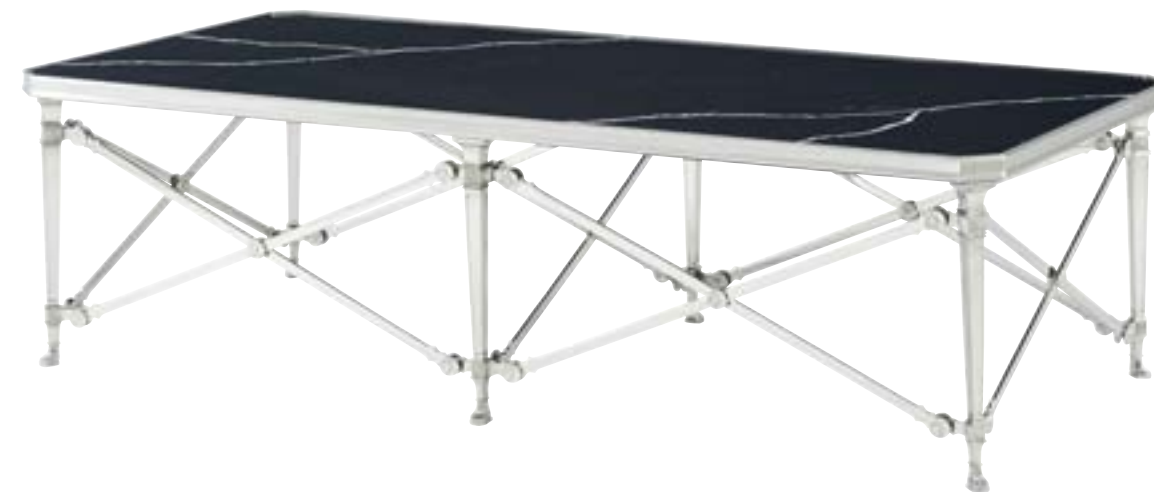
SPENCER LONDON RECTANGULAR NICKEL COCKTAIL TABLE TA51289 60 x 30 x 17 in | 152.4 x 76.2 x 43.2 cm As shown in Nickel Plated