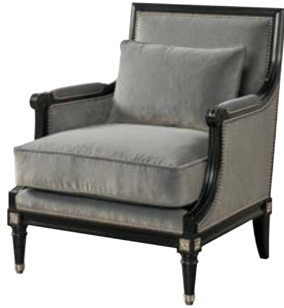
BROMLEY CHAIR SL3215

Shown in 6230-95 Fabric Shown in Carlisle Black Finish