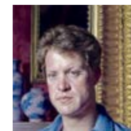
Charles Edward Maurice, 9th Earl Spencer