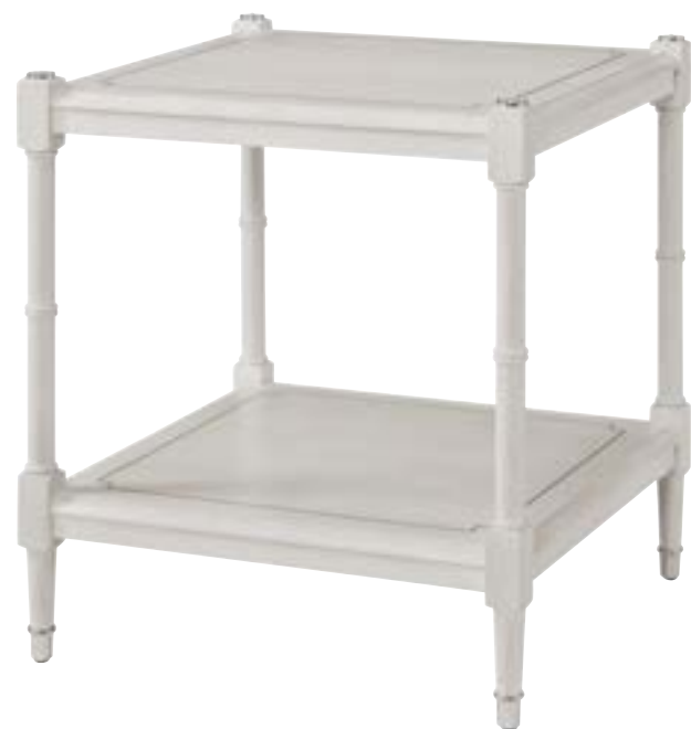
SPENCER LONDON SIDE TABLE TA50314.C400 22 x 22 x 24 in | 55.9 x 55.9 x 61 cm As shown in Chelsea finish Also available in Fulham finish: TA50314.C399