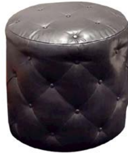
DAGENHAM TUFTED STOOL SL8196

22 x 22 x 21.5 in | 55.88 x 55.88 x 54.6 cm As shown in 9009-94 fabric