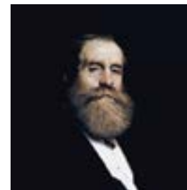
John Poyntz, 5th Earl Spencer