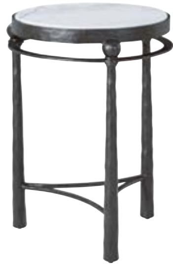
SPENCER LONDON ROUND METAL DRINK TABLE TA50420 15¾ x 15¾ x 22 in | 40.3 x 40.3 x 55.9 cm As shown in Rustic Metal