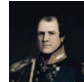
Frederick, 4th Earl Spencer