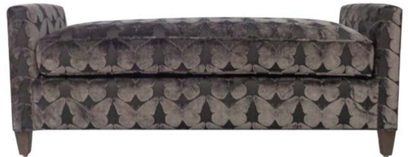
BARNET BENCH SL8190

22 x 22 x 21.5 in | 55.88 x 55.88 x 54.6 cm