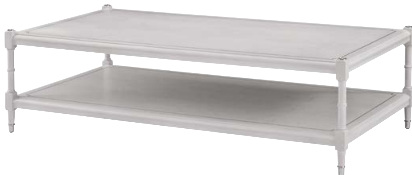
SPENCER LONDON COCKTAIL TABLE TA51224.C400 60 x 32 x 17 in | 152.4 x 81.3 x 43.2 cm As shown in Chelsea finish Also available in Fulham finish: TA51224.C399