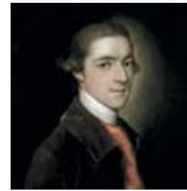
John Spencer, created Earl Spencer