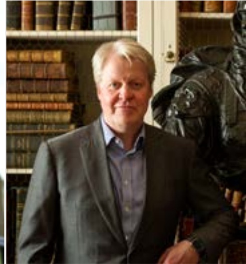
THE 9 TH EARL SPENCER