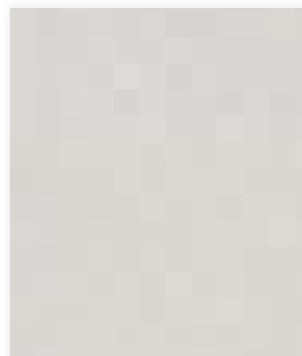
NICKEL PLATED BRASS