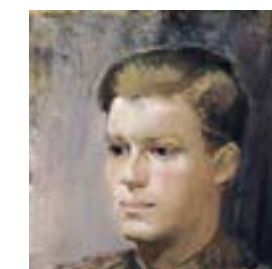
Edward John, 8th Earl Spencer