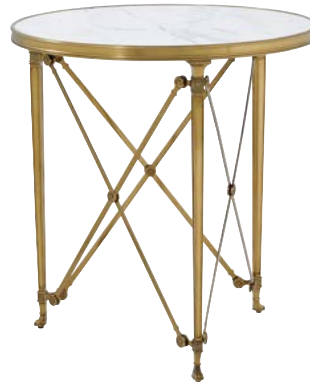
SPENCER LONDON ROUND BRASS CENTER TABLE TA55008 28 x 28 x 29½ in | 71.1 x 71.1 x 74.9 cm