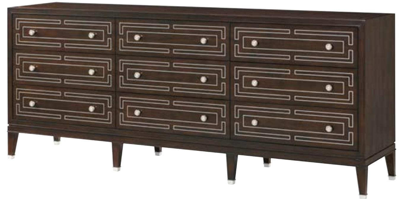
SPENCER LONDON 9-DRAWER DRESSER TA60164.C399 86 x 20 x 36¼ in | 218.4 x 50.8 x 92.1 cm As shown in Fulham finish Also available in Chelsea finish: TA60164.C400