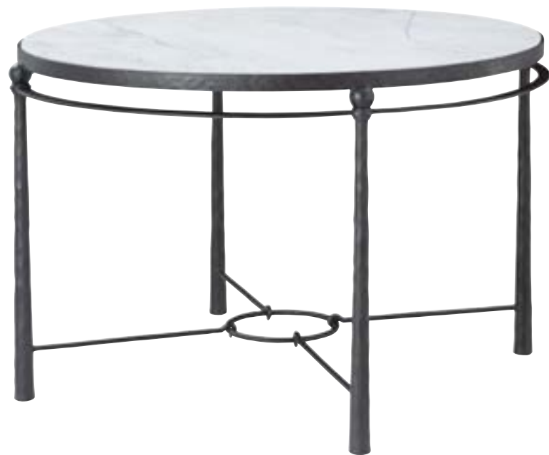
SPENCER LONDON ROUND METAL CENTER TABLE TA55010 47 x 47 x 30 in | 119.4 x 119.4 x 76.2 cm As shown in Rustic Metal