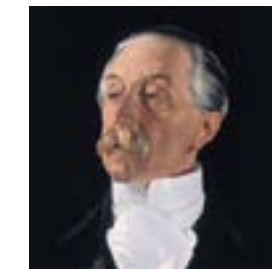
Charles Robert, 6th Earl Spencer