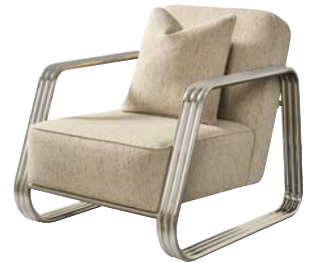
HAMMERSMITH CHAIR SL3217

Shown in 2049-93 Fabric Shown in Fulham Finish