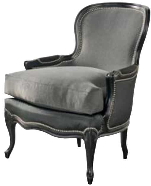
ISLINGTON CHAIR SL3216

28 x 30 x 36½ in | 71.12 x 76.2 x 92.71 cm