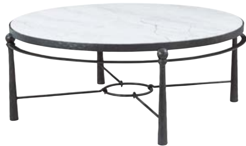
SPENCER LONDON ROUND METAL COCKTAIL TABLE TA51288 47 x 47 x 17 in | 119.4 x 119.4 x 43.2 cm As shown in Rustic Metal