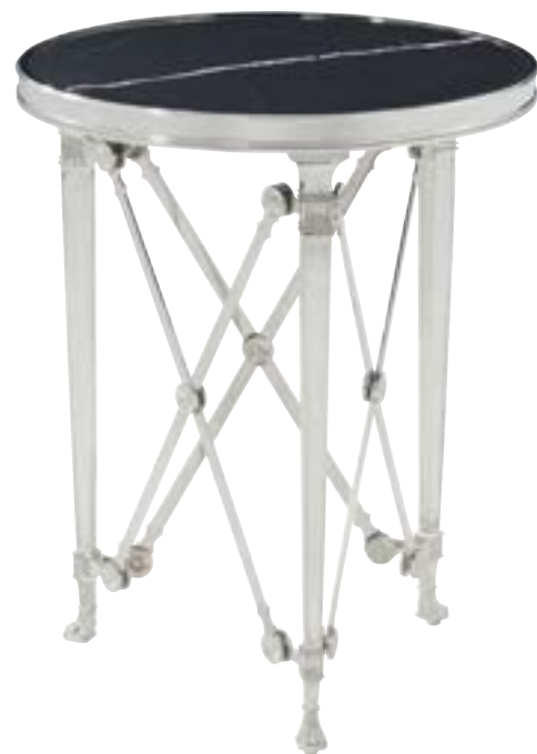
SPENCER LONDON ROUND NICKEL SIDE TABLE TA50399 18 x 18 x 22 in | 45.7 x 45.7 x 55.9 cm