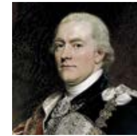
George John, 2nd Earl Spencer