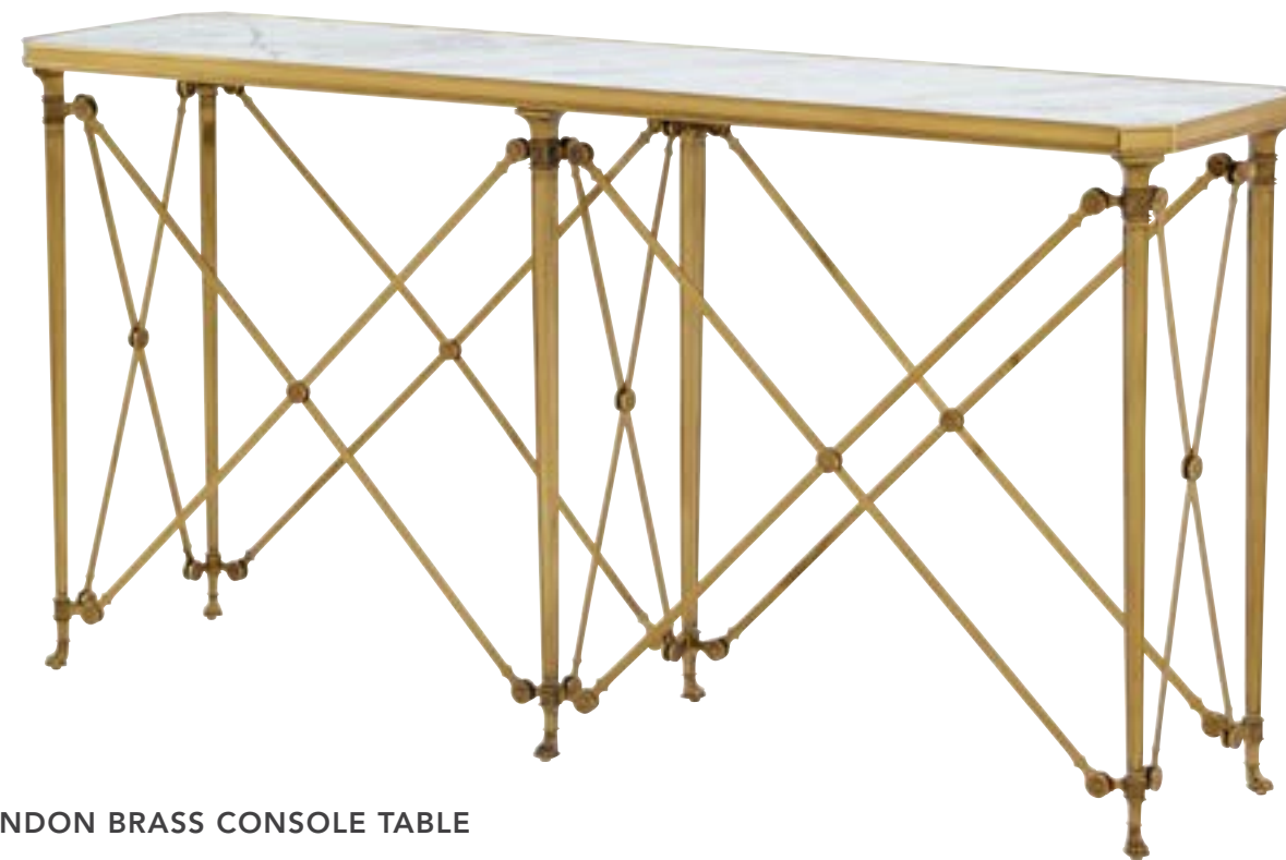
SPENCER LONDON BRASS CONSOLE TABLE TA53138 64 x 16 x 32 in | 162.6 x 40.6 x 81.3 cm