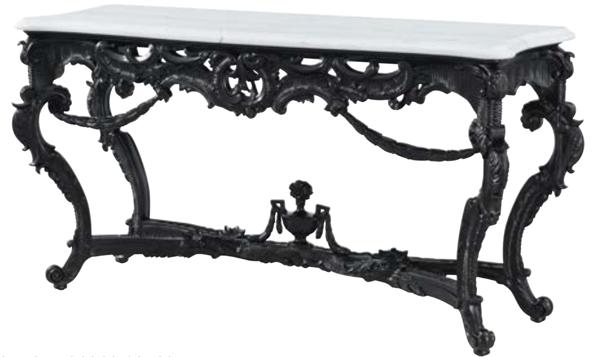
SPENCER LONDON ROCOCO CONSOLE TA53145 74 x 24¼ x 38¾ in | 188.1 x 62.8 x 98.5 cm