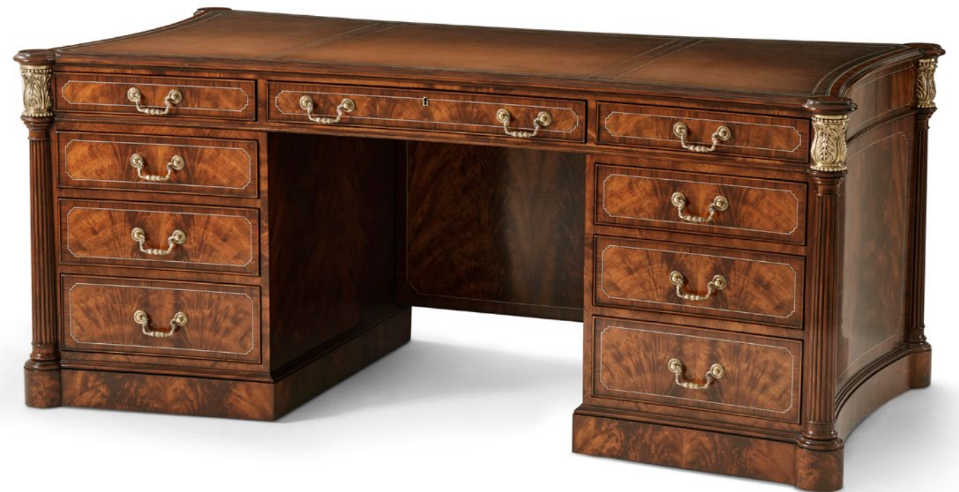
AVENEIL DESK SC71004

A fine flame mahogany veneered and crossbanded pedestal desk with fine double stringing details, the gilt tooled leather inset concave sided top with protruding rounded corners supported by reeded columns with acanthus cast brass capitals, above a central lockable frieze drawer flanked by two further drawer, above pedestals with three graduated drawers each, on a flame mahogany veneered plinth base. The reverse with a modesty panel. 72 x 38 x 30½ in | 182.88 x 96.52 x 77.5 cm