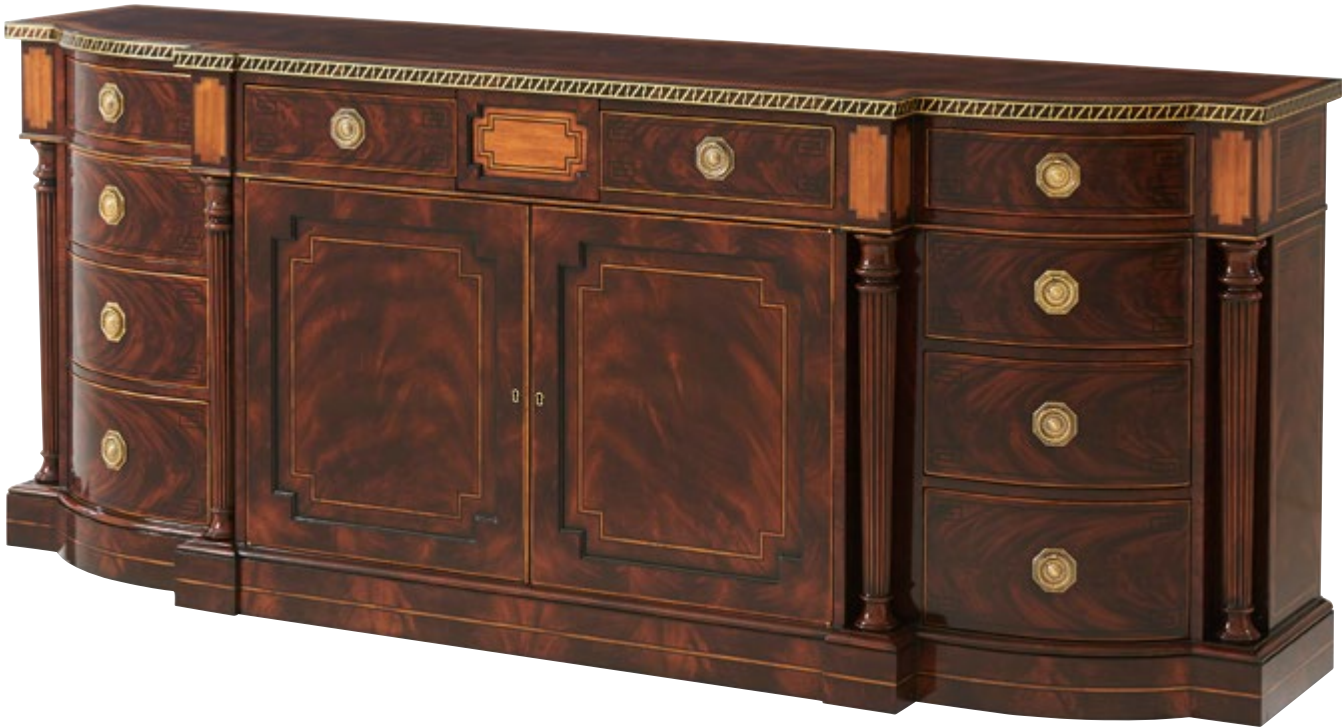
DONWELL BUFFET 6105-436

68 x 17¾ x 37½ in | 172.7 x 44.8 x 95.3 cm