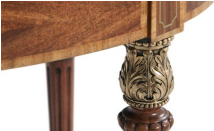
ALERON SIDE TABLE SC50013

A finely Walcot finish Etimoe and movingue banded side table with fine brass inlaid stringing, the oval top above a veneered frieze on turned and fluted legs with acanthus leaf cast brass capitals and feet, joined by a concave sided undertier.