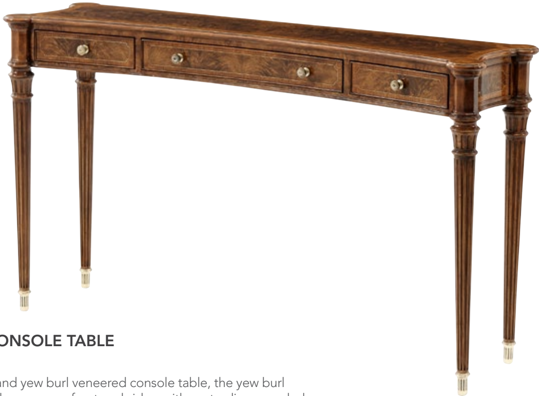
GRANDISON CONSOLE TABLE 5305-256

48 x 17 x 34 in | 121.92 x 43.2 x 86.4 cm