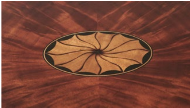
LARGE MOMPESSEON ACCENT TABLE 5005-832

An oval flame veneered accent table, the oval fan inlaid, satinwood banded and line strung top with a caddy moulded edge and an undulating inlaid apron, on satinwood inlay panelled square tapering legs terminating in spade feet.