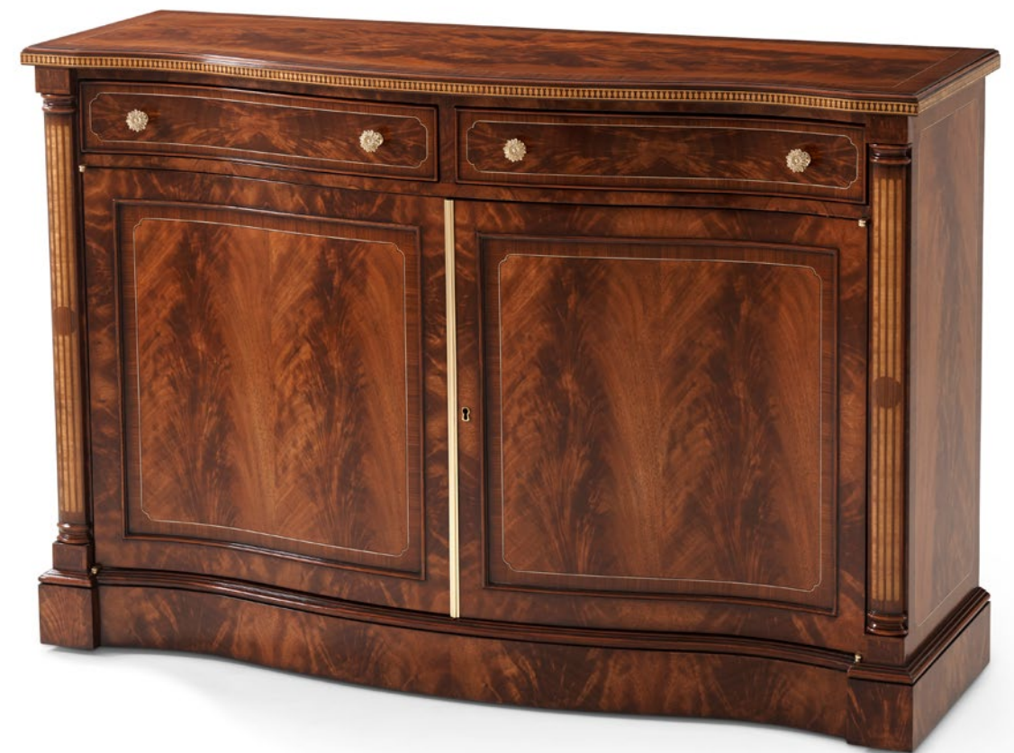
TRISTAM CABINET SC61028

54 x 22 x 33 in | 137.16 x 55.88 x 83.82 cm