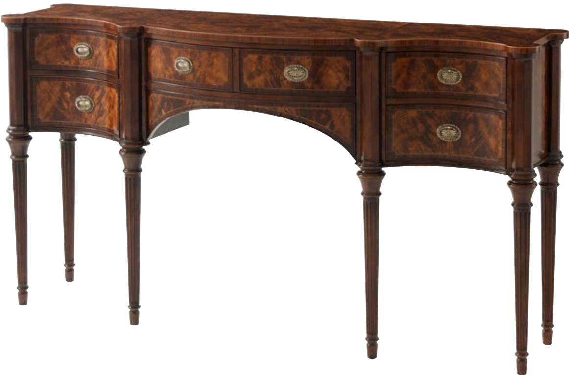
STANHOPE ROW SIDEBOARD 5305-214

A mahogany, flame veneered and line strung sideboard, the serpentine morado crossbanded top with protruding corners above turned uprights and tapering fluted legs, the central double fronted frieze drawer above an arched apron, flanked by two concave fronted drawers, on turned tapering legs.