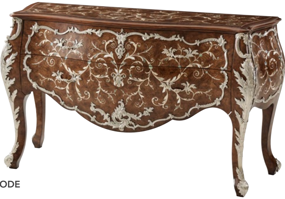
LAURENT BOMBE COMMODE SC60014

54 x 17½ x 34 in | 137 x 44.5 x 86.34 cm