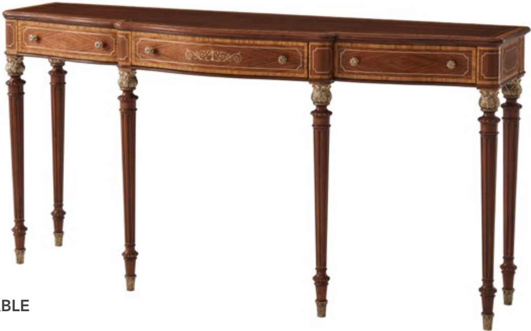
ALERON SERVING TABLE SC53008

54 x 14½ x 34 in | 137.1 x 36.9 x 86.4 cm