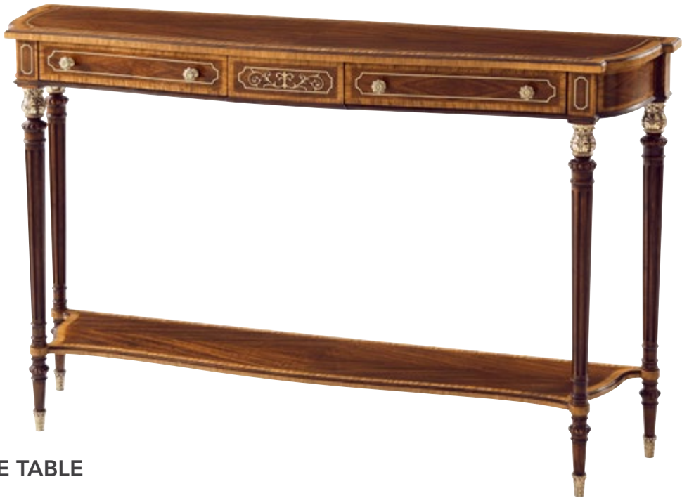
LARGE TOMLIN CONSOLE TABLE SC53001

Serpentine Top with Two Frieze Drawers Brass Floral & Line Inlaid Figured Etimoe Veneer Primavera Veneer Banding Walcot Finish Old English Brass Accents