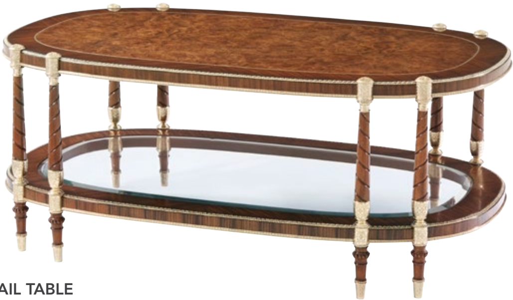
THE TIMOTHY COCKTAIL TABLE SC51016

18 x 18 x 26½ in | 45.72 x 45.72 x 67.3 cm