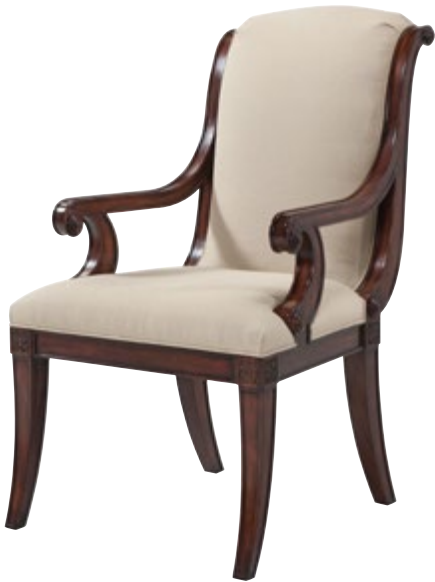
GABRIELLE'S ARMCHAIR 4100-787COM

A mahogany side chair, the overscroll padded back and seat above floral capital carved and panelled sabre legs. Inspired by a 19th century French original. 23 x 32 x 42½ in | 58.5 x 81.3 x 108 cm Seat height: 19½ in (49.5 cm)