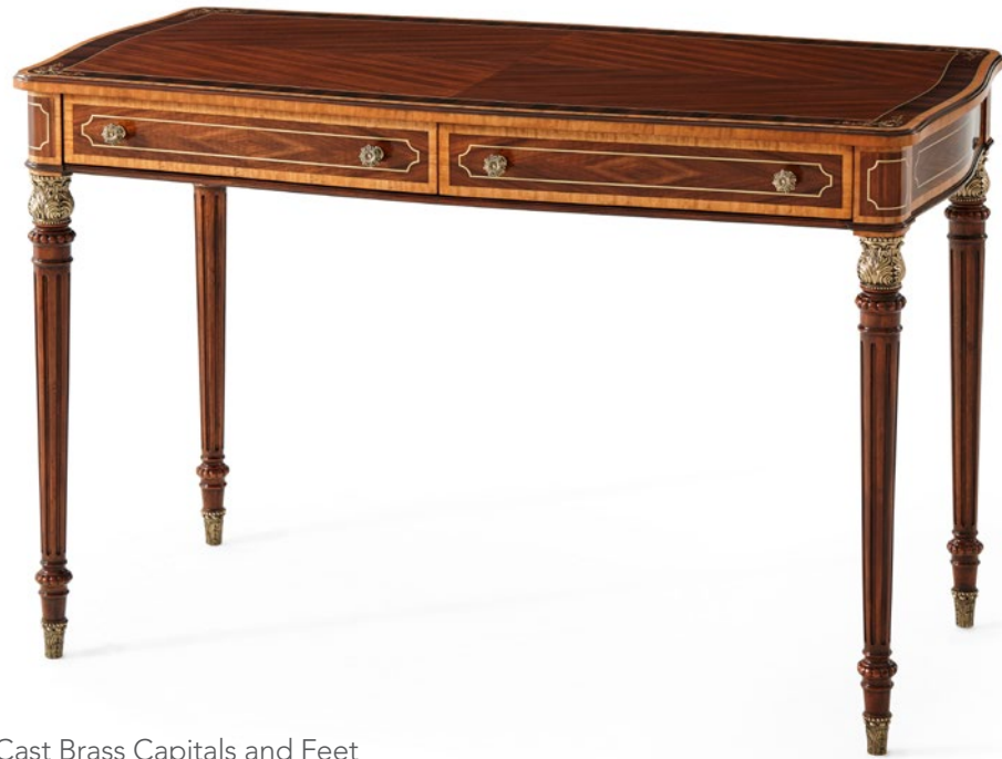
MORLEY DESK SC71002

Two Frieze Drawers Turned & Fluted Legs with Acanthus Cast Brass Capitals and Feet Solid Mahogany & Figured Etimoe Veneer Primavera Veneer Crossbanding Floral & Brass Line Inlaid Walcot Finish with Old English Brass Accents 46 x 24 x 30 in | 116.8 x 61 x 76.2 cm