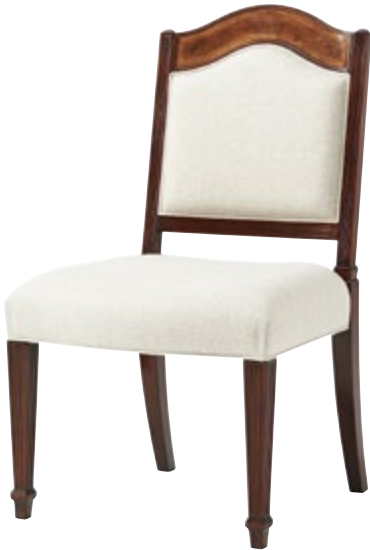
SHERATON'S SATINWOOD SIDE CHAIR 4005-045COM

A fine mahogany, satinwood and walnut burl veneered dining chair, the arched back with a finely veneered arched top rail between reeded uprights and above a padded back and bowed seat, on reeded square tapering legs with spade feet. Inspired by an 18th century original by Thomas Sheraton.