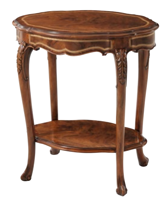
OVAL MILLARD ACCENT TABLE SC50010

An Oxford finish swirl walnut and mahogany banded Accent Table with Primavera and ebonized stringing details, the serpentine molded edge oval top above a shaped frieze on finely acanthus carved cabriole legs joined by a serpentine oval undertier. 24 x 16 x 26 in | 61 x 40.64 x 66.04 cm