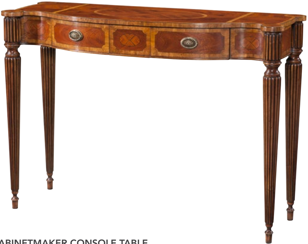
THE GEORGIAN CABINETMAKER CONSOLE TABLE 5305-203

A figured mahogany, eucalyptus and morado crossbanded console table, the serpentine top with a bowed front and sides centred by a morado oval inlay, the banded frieze with two frieze drawers with natural brass handles, on turned and fluted tapering legs. Inspired by a George III original.