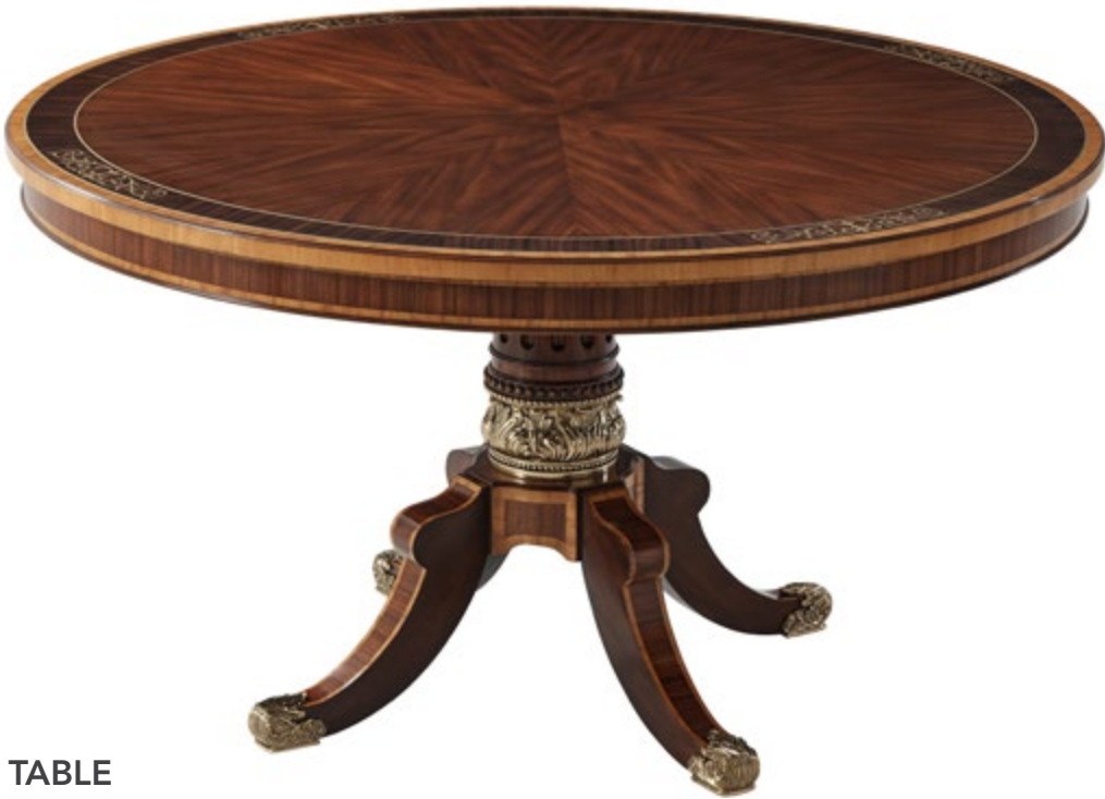
TRENTON DINING TABLE SC54001

Brass Inlaid Mahogany & Figured Etimoe Primavera Veneer Crossbanding with Brass Floral & Line Inlay Walcot Finish Bold Old English Acanthus Cast Brass Accents 53¼ x 53¼ x 30 in | 135 x 135 x 76.2 cm