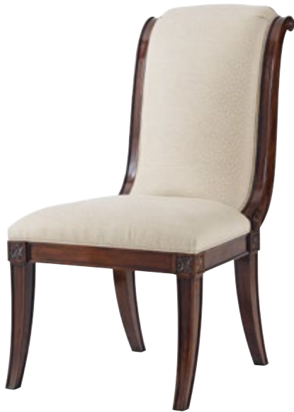
GABRIELLE SIDE CHAIR 4000-787COM

A mahogany side chair, the overscroll padded back and seat above floral capital carved and panelled sabre legs. Inspired by a 19th century French original. 23 x 32 x 42½ in | 58.5 x 81.3 x 108 cm Seat height: 19½ in (49.5 cm)