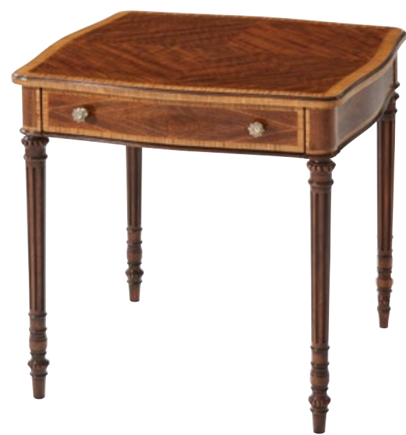
ADOLPHUS SIDE TABLE II SC50004

Solid Mahogany, Etimoe Veneer & Primavera Veneer Walcot Finish with Floral and Brass Line Inlaid Details Old English Brass Accents 26 x 26 x 26 in | 66 x 66 x 66 cm