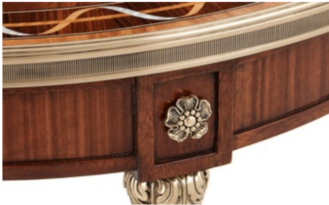
PAULETTE SIDE TABLE II SC50029

A very fine mahogany and etimoe veneered side table, the Morado and Movingue crossbanded top with fine stringing and a paper twist marquetry design in sycamore and mother of pearl, inlaid to the center with a flowerhead roundel with mother of pearl details, bound in brass above a paneled frieze with floral brass accents and brass inlay, on fluted columns with acanthus capitals and bases, joined by a Movingue crossbanded concave sided undertier.