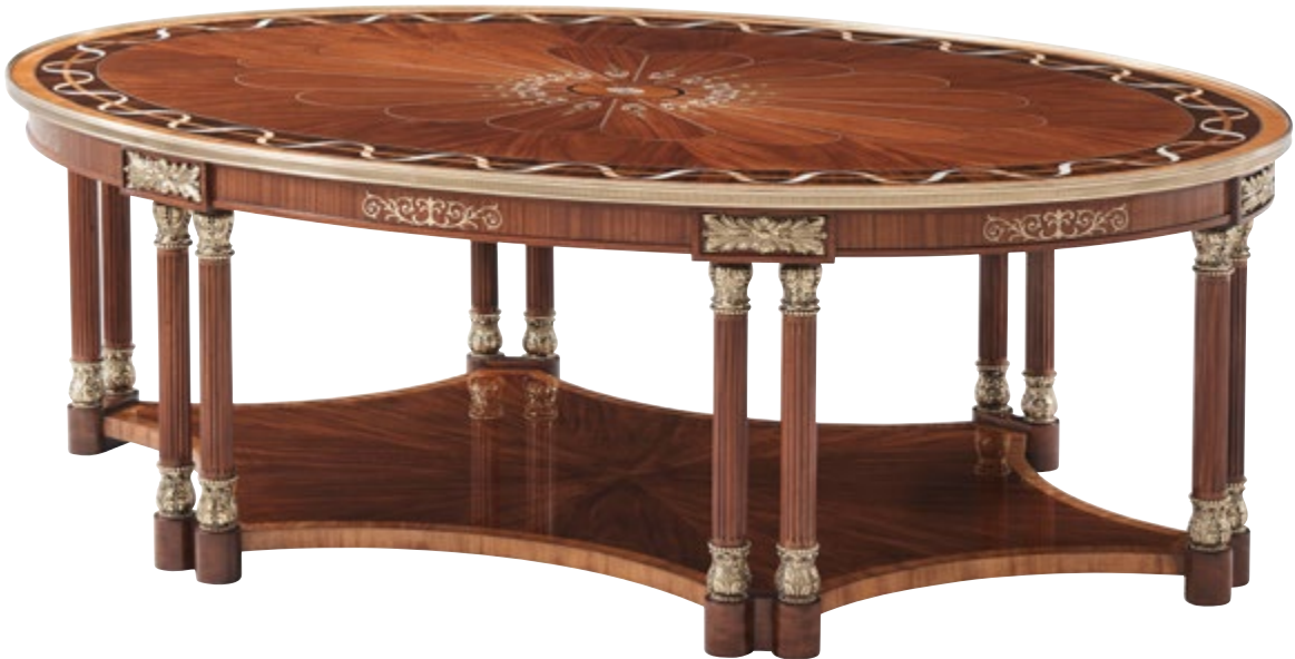
PAULETTE COCKTAIL TABLE SC51011

A very fine mahogany and etimoe veneered cocktail table, the Morado and Movingue crossbanded top with fine stringing and a paper twist marquetry design in sycamore and mother of pearl, inlaid to the center with a bold flowerhead with mother of pearl floral details, bound in brass above a paneled frieze with floral brass accents and brass inlay, on fluted columns with acanthus capitals and bases, joined by a Movingue crossbanded concave sided undertier.