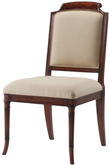
ATCOMBE SIDE CHAIR 4000-866COM

23½ x 25¼ x 43 in | 59.7 x 64 x 109.2 cm Seat height: 19½ in (49.5 cm) | Arm height: 25 in (63.5 cm)