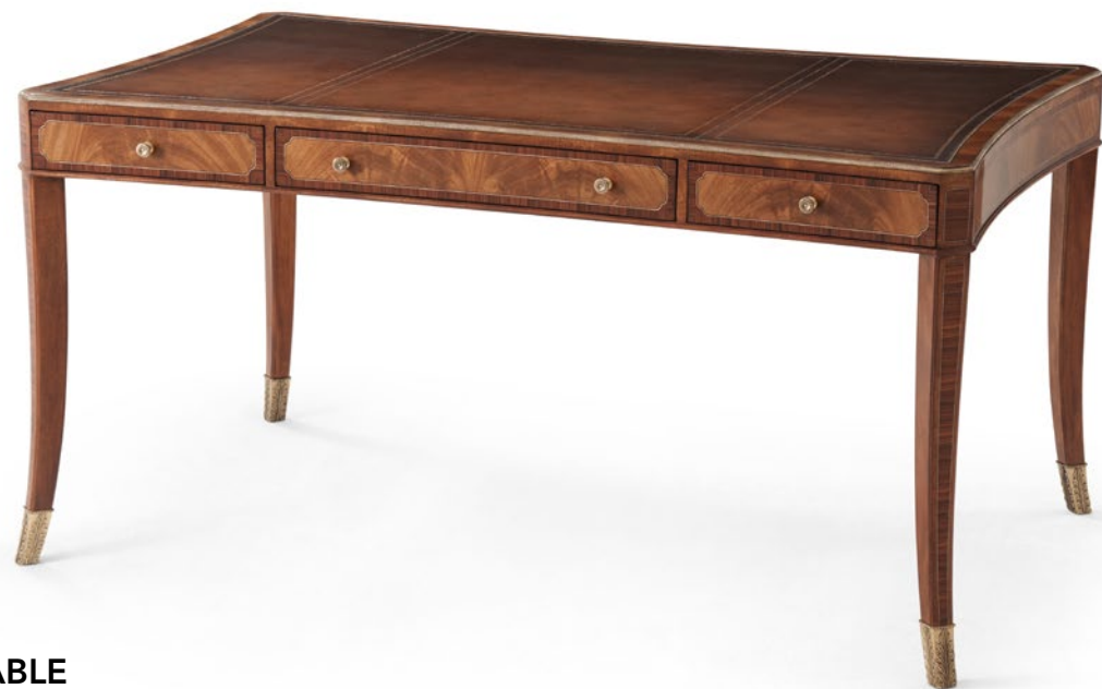
AUDRIC WRITING TABLE SC71006

Two Frieze Drawers Turned & Fluted Legs with Acanthus Cast Brass Capitals and Feet Solid Mahogany & Figured Etimoe Veneer Primavera Veneer Crossbanding Floral & Brass Line Inlaid Walcot Finish with Old English Brass Accents 46 x 24 x 30 in | 116.8 x 61 x 76.2 cm