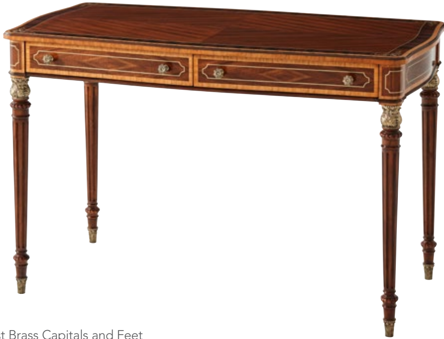
MORLEY DESK SC71002

Two Frieze Drawers Turned & Fluted Legs with Acanthus Cast Brass Capitals and Feet Solid Mahogany & Figured Etimoe Veneer Primavera Veneer Crossbanding Floral & Brass Line Inlaid Walcot Finish with Old English Brass Accents