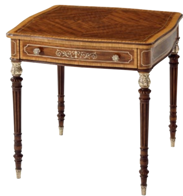
ADOLPHUS SIDE TABLE SC50001

Solid Mahogany, Etimoe Veneer & Primavera Veneer Walcot Finish with Floral and Brass Line Inlaid Details Old English Brass Accents 26 x 26 x 26 in | 66 x 66 x 66 cm