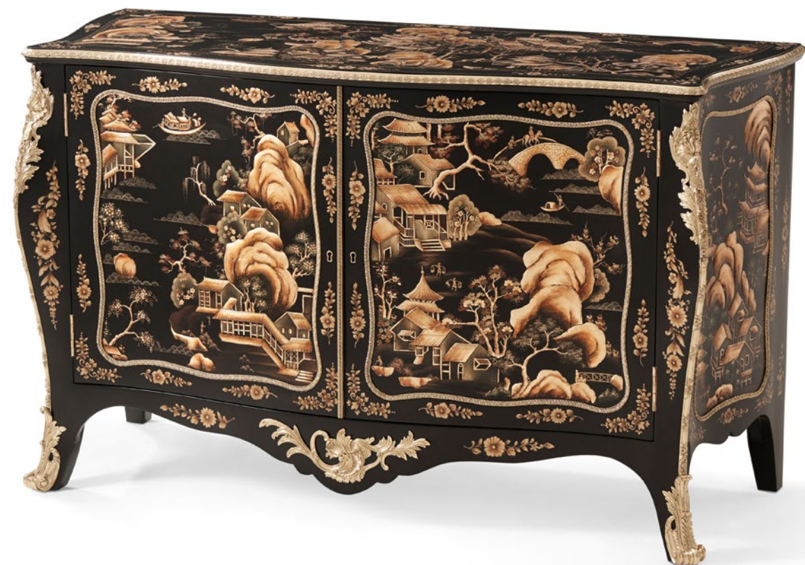
THE CLAYDON CABINET SC61027

An exceptional black Chinoiserie lacquered serpentine commode, the richly hand painted top of Chinoiserie landscapes and floral details above an cast brass floral decorated edge and two finely cast brass molding paneled doors enclosing a burgundy interior with one long adjustable shelf, the scroll uprights with bold Rococo cast brass mounts trailing to splayed feet centered by an undulating and Rocaille brass mounted apron.