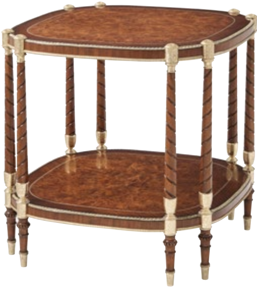
THE TIMOTHY SIDE TABLE SC50031

A fine golden Madrone burl veneered and Morado banded side table, the rounded square brass molded top with finely cast and engraved brass capitals and mounts and spiral turned mahogany legs, joined by a brass molded undertier and terminating in turned tapering legs with engraved cast brass toupie feet.