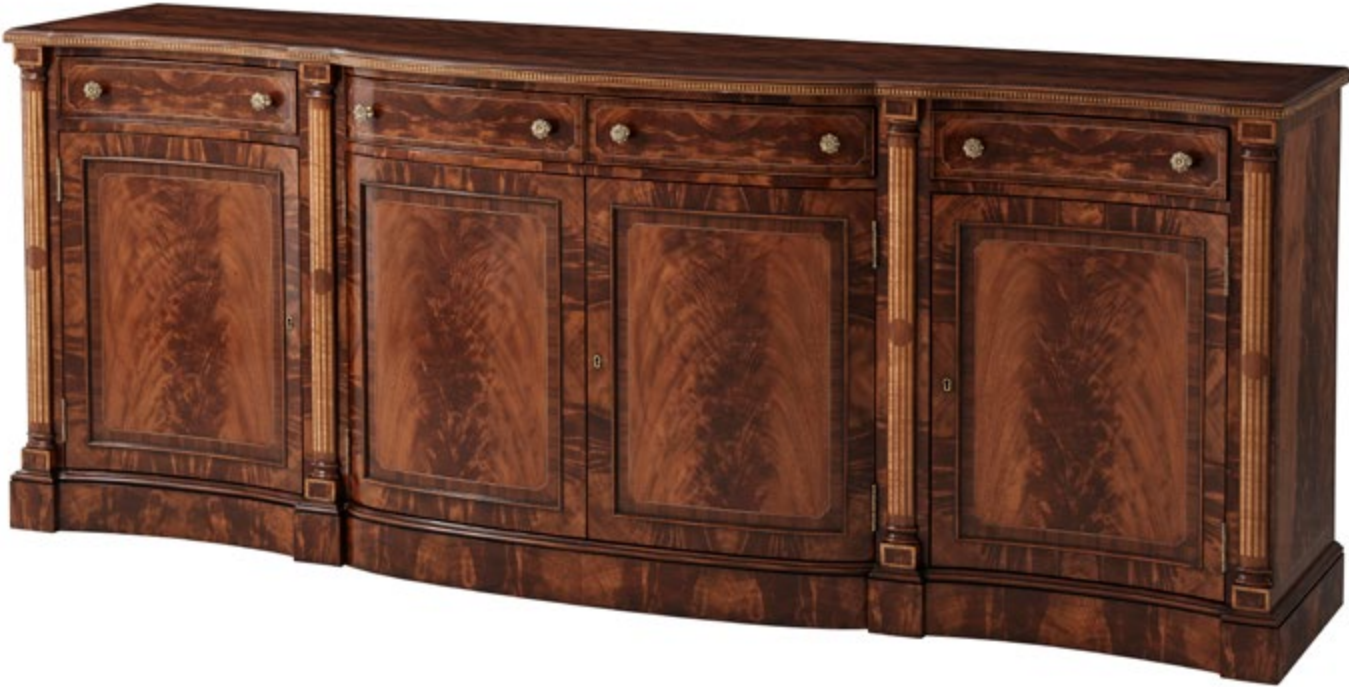
AVENALL SIDEBOARD SC61018

A flame mahogany and Morado banded sideboard with fine double stringing in sycamore and ebony, the serpentine crossbanded top above four frieze drawers, above four paneled cabinet and lockable cabinet doors flanked by fluted inlaid rounded columns, on a shaped plinth base. 89½ x 22 x 36 in | 227.4 x 55.9 x 91.45 cm