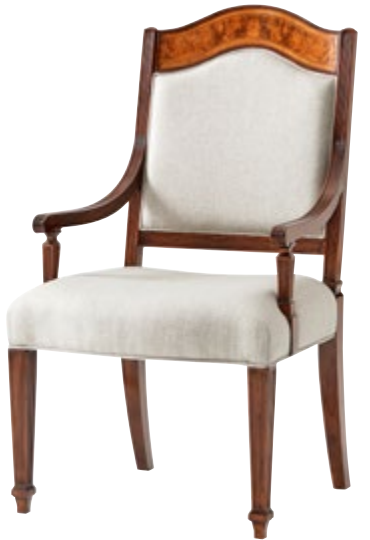
SHERATON'S SATINWOOD ARMCHAIR 4105-045COM

22 x 24¾ x 40 in | 56 x 63 x 101.5 cm Seat height: 19¼ in (49 cm)