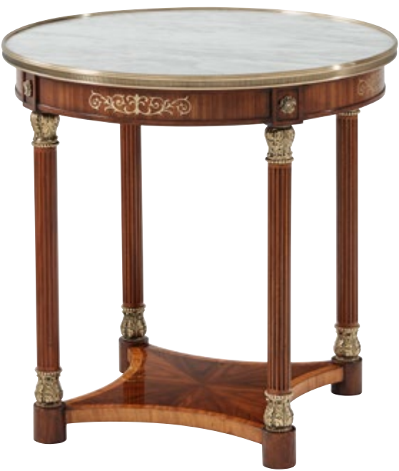
PAULETTE SIDE TABLE SC50027

A very fine mahogany and etimoe veneered side table, the circular Bianco Carrara marble top bound in brass above a paneled frieze with floral brass accents and brass inlay, on fluted columns with acanthus capitals and bases, joined by a Movingue crossbanded concave sided undertier. 26¼ x 26¼ x 26¼ in | 66.6 x 66.6 x 66.6 cm