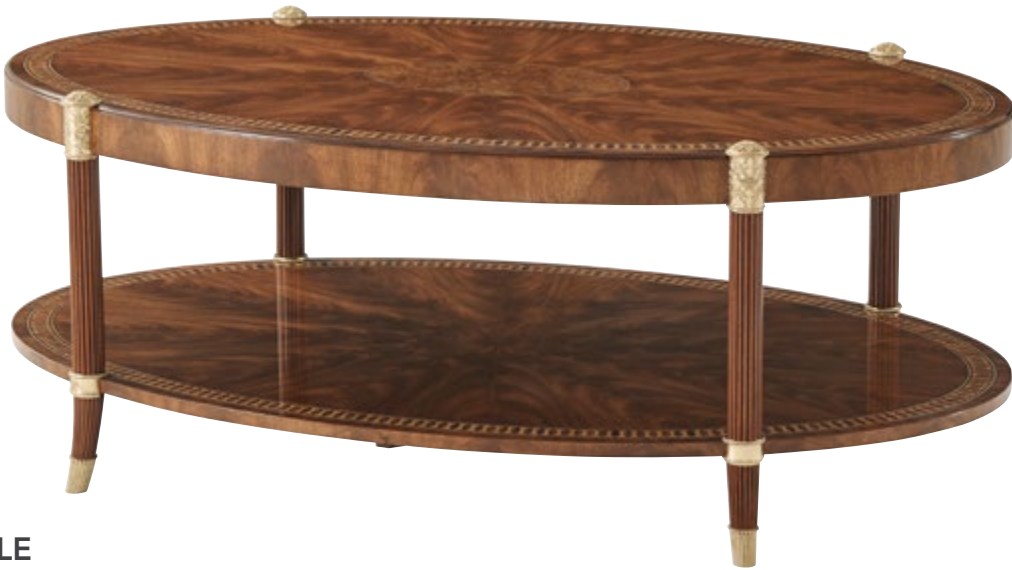
THE VERILY COCKTAIL TABLE SC51014

48 x 28½ x 20 in | 121.92 x 72.39 x 50.8 cm