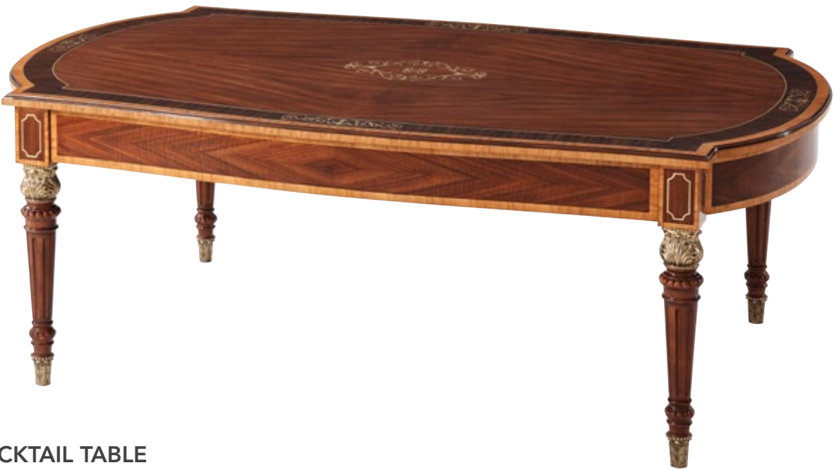
SOPHIE COCKTAIL TABLE SC51001

64 x 42 x 21 in | 162.56 x 106.7 x 53.3 cm