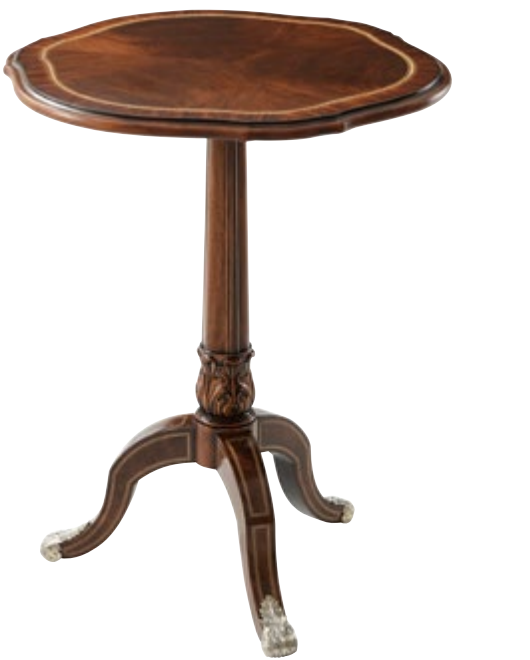
MILLARD ACCENT TABLE SC50011

An Oxford finish swirl walnut and mahogany banded Accent Table with Primavera and ebonized stringing details, the serpentine shaped edge top on a finely acanthus carved and segmented column, on 'S' scroll veneered and strung legs. 21 x 21 x 26 in | 53.34 x 53.34 x 66.04 cm