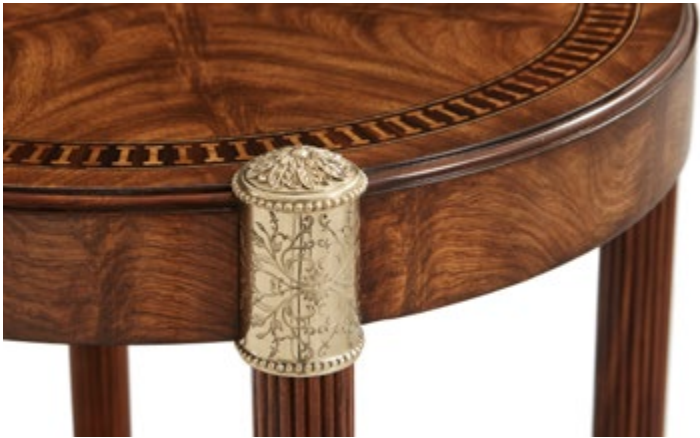
THE VERILY END TABLE SC50033

A flame Cerejeira veneered and parquetry crossbanded side table, the circular caddy molded top centered by an amboyna burl veneered oval, the finely cast brass capital reeded mahogany legs terminating in splayed feet with reeded brass cappings and joined by a parquetry banded undertier.