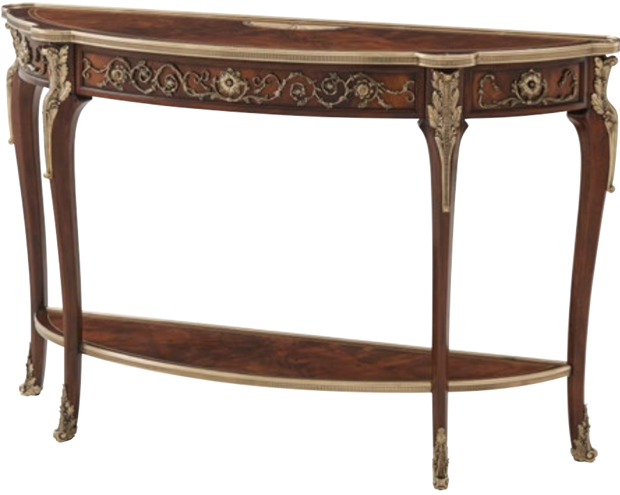
MELINA COSOLETABLE SC53014.C188

72 x 20 x 36 in | 182.88 x 50.8 x 91.44 cm