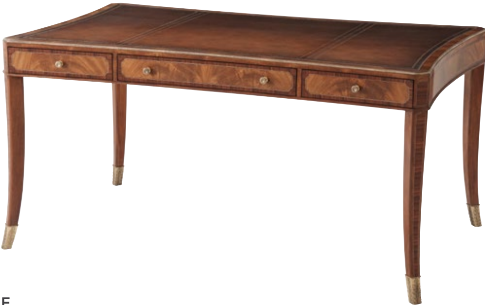
AUDRIC WRITING TABLE SC71006

A fine flame Cerejeira veneered, Morado banded & Sycamore marquetry inlaid writing table, the rectangular concave sided cast brass edged and gilt tooled leather inlaid top with canted angles, above a Morado banded paneled frieze with double stringing and three drawers, on similar sabre legs with acanthus leaf cast cappings.