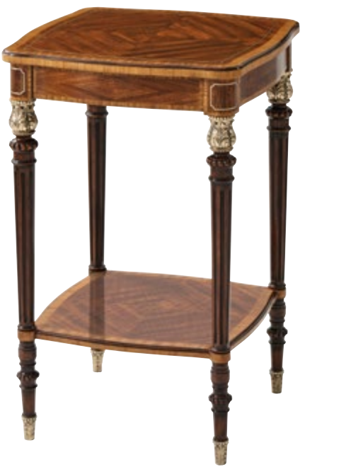
BECKETT ACCENT TABLE SC50002

Solid Mahogany, Etimoe Veneer & Primavera Veneer Walcot Finish with Brass Line Inlaid Details Old English Brass Accents 18 x 18 x 29 in | 45.7 x 45.7 x 73.6 cm