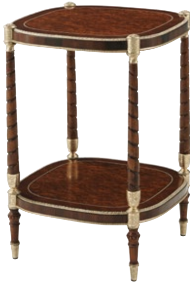
THE TIMOTHY END TABLE SC50032

A fine golden Madrone burl veneered and Morado banded end table, the brass molded top with finely cast and engraved brass capitals and mounts and spiral turned mahogany legs, joined by a brass molded undertier with beveled Glass insert and terminating in turned tapering legs with engraved cast brass toupie feet.