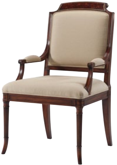
ATCOMBE ARMCHAIR 4100-866COM

21 x 27½ x 41 in | 53.3 x 70 x 104 cm Seat height: 19¾ in (50.2 cm)